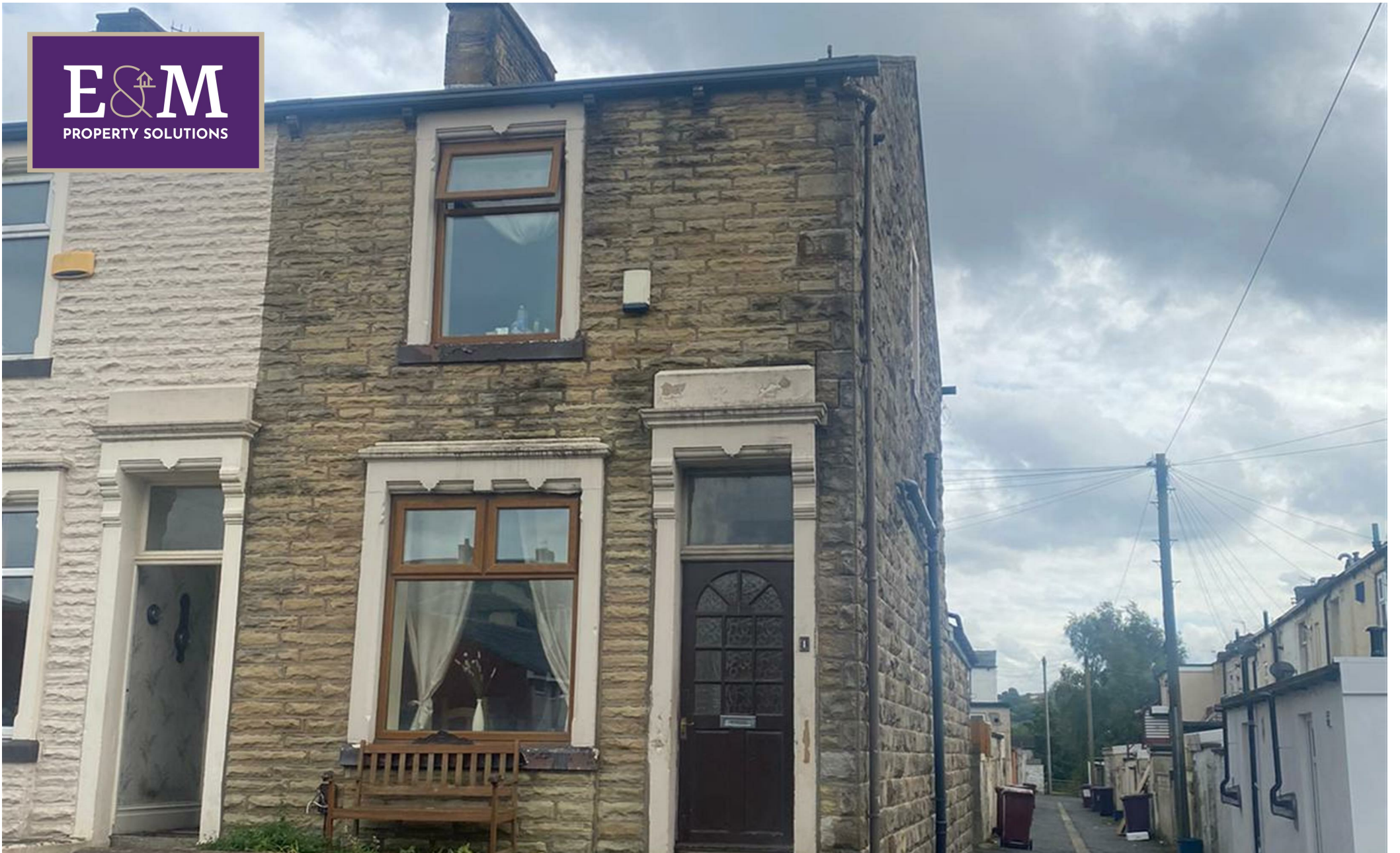
1 Claremont Street, Burnley, Lancashire, BB12 0HG Asking price £85,000