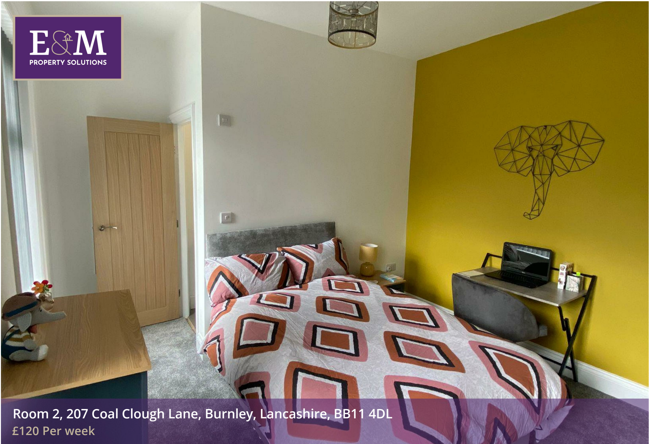
Room 2, 207 Coal Clough Lane, Burnley, Lancashire, BB11 4DL £120 Per week