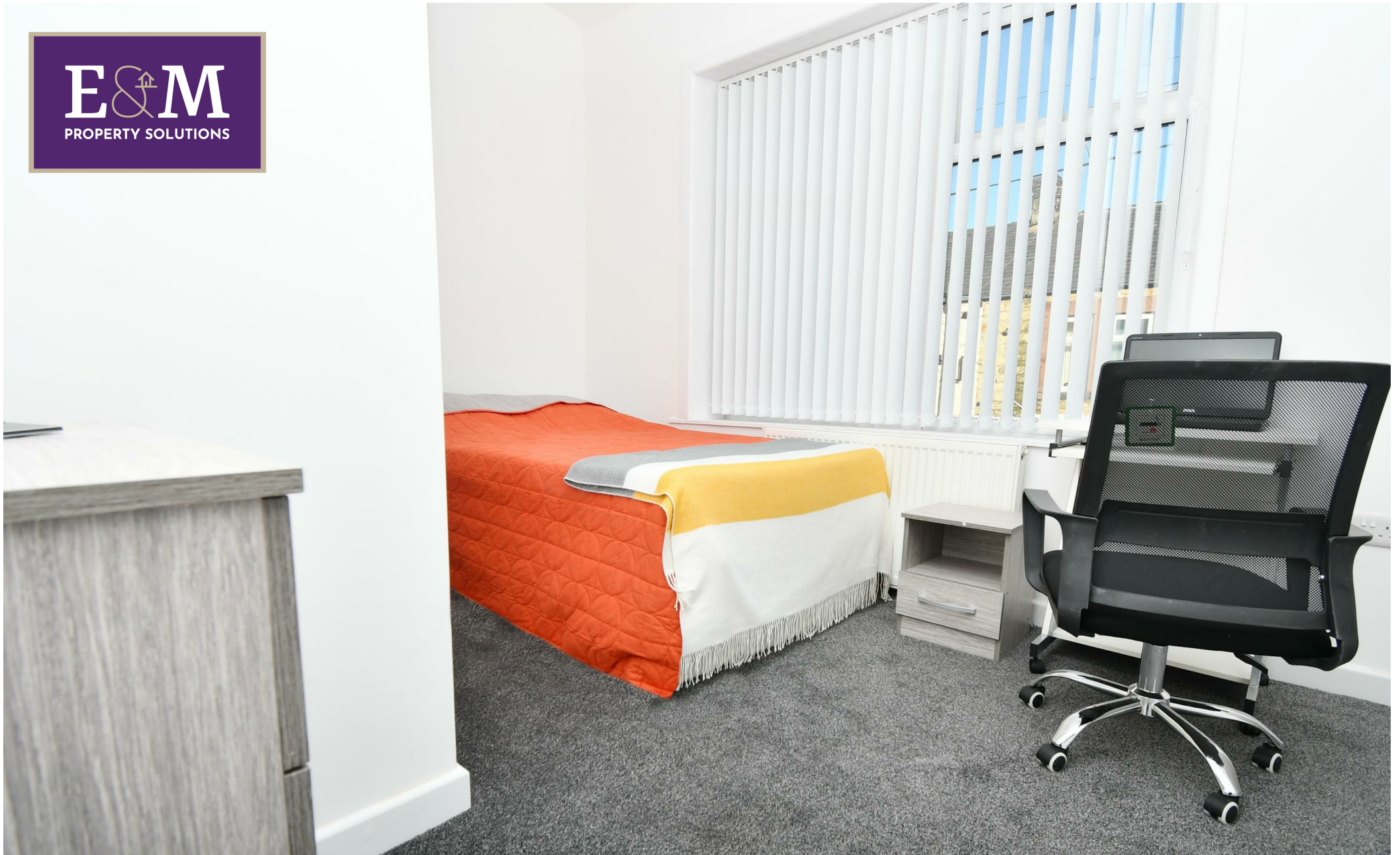
Room 3, 42 Hart Street, Burnley, Lancashire, BB11 2SG £105 Per week