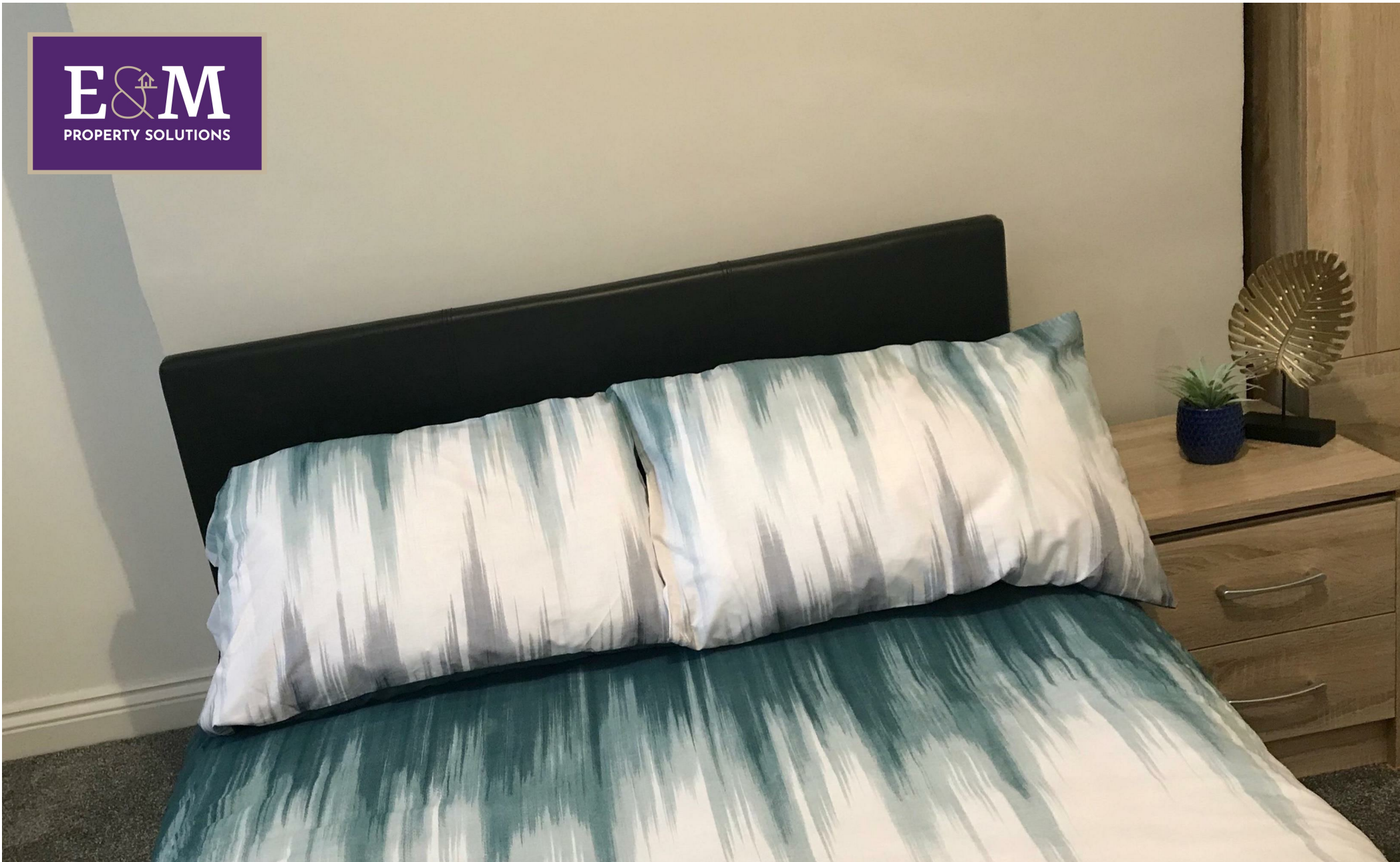
Room 3, 47 Brennand Street, Burnley, Lancashire, BB10 1SU £100 Per week