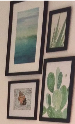
Room 4, 43 Coal Clough Lane, Burnley, Lancashire, BB11 4NS £90 Per week