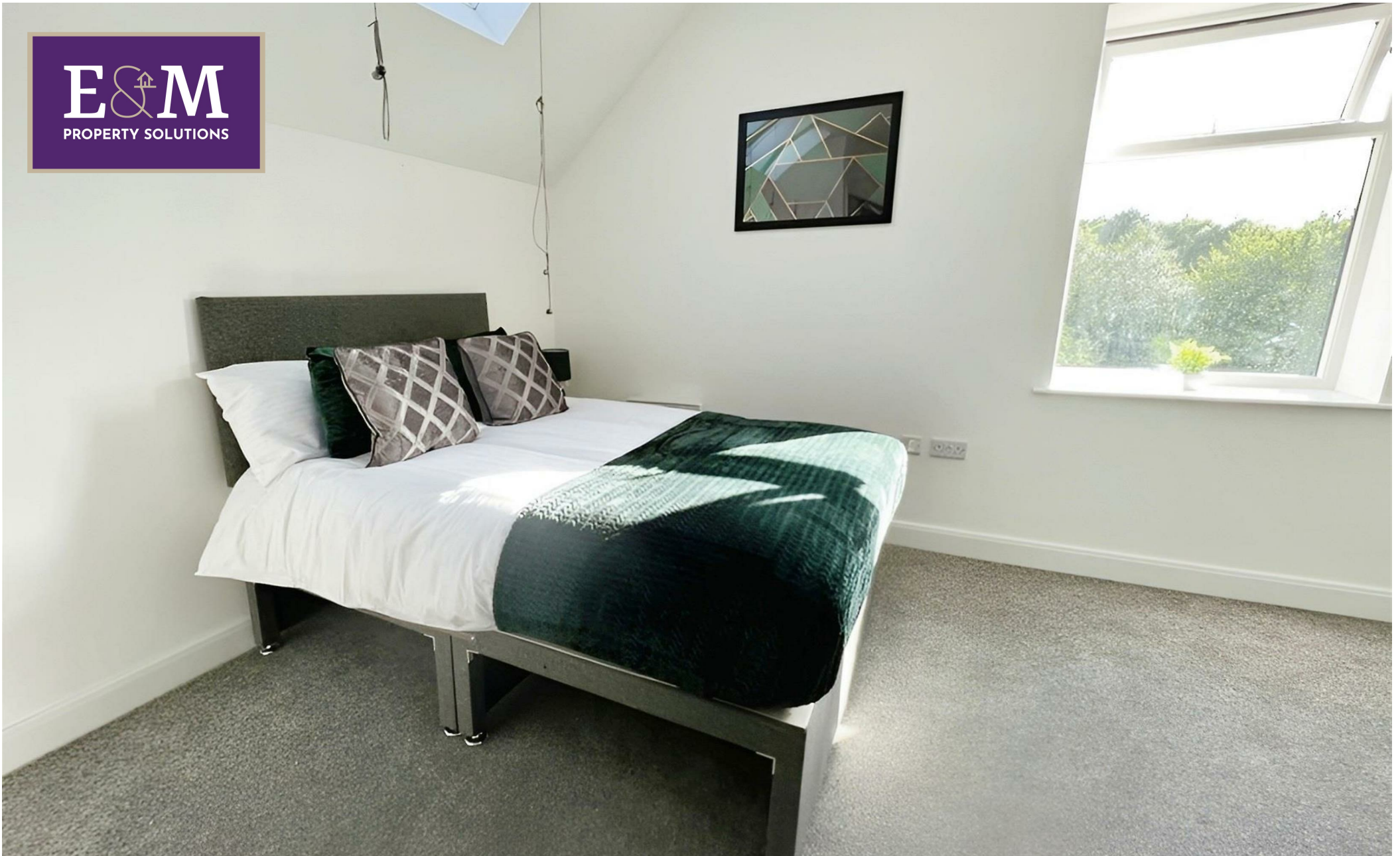
Room 5, 79-81 Church Street, Burnley, Lancashire, BB11 2RS £130 Per week