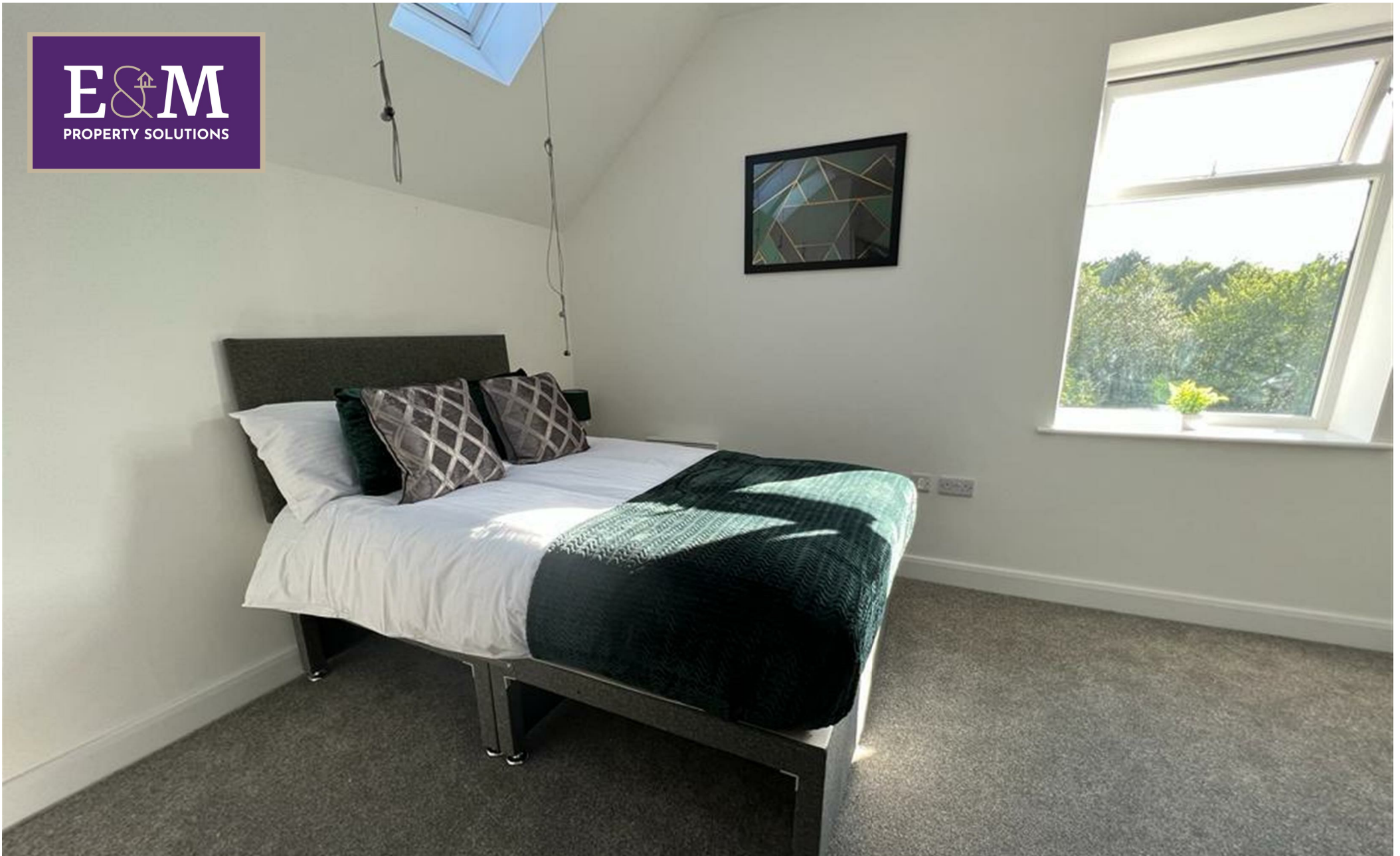
Room 5, 79-81 Church Street, Burnley, Lancashire, BB11 2RS £140 Per week