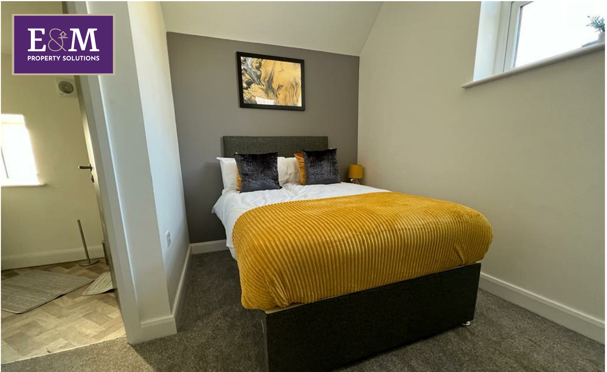
Room 4, 79-81 Church Street, Burnley, Lancashire, BB11 2RS £140 Per week