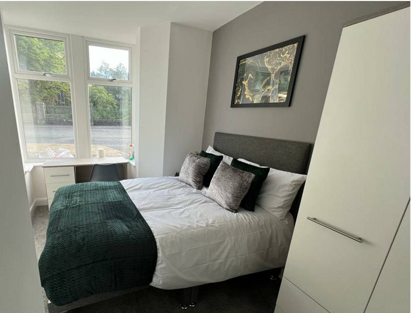
Room 3, 79-81 Church Street, Burnley, Lancashire, BB11 2RS £130 Per week