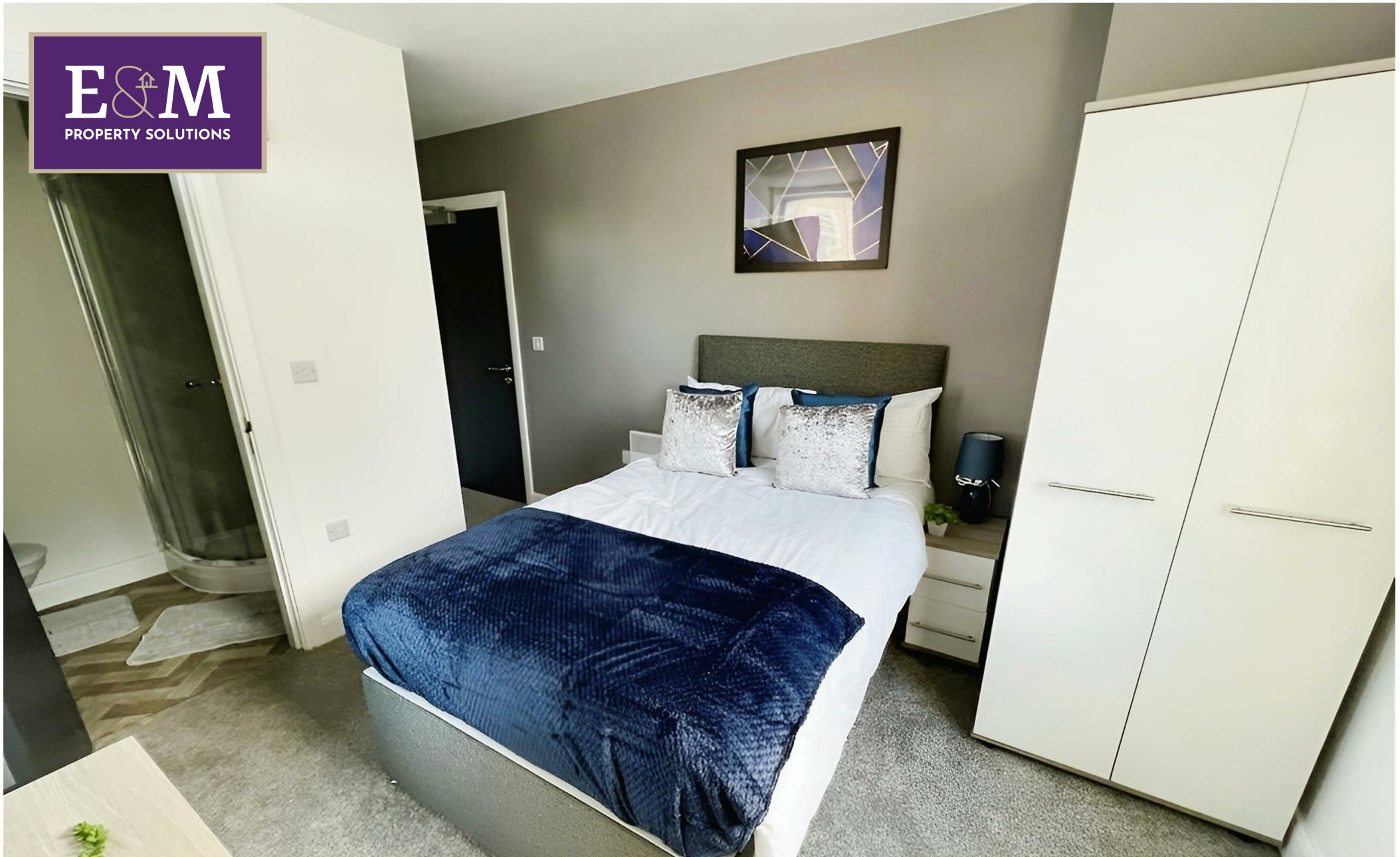
Room 2, 79-81 Church Street, Burnley, Lancashire, BB11 2RS £130 Per week