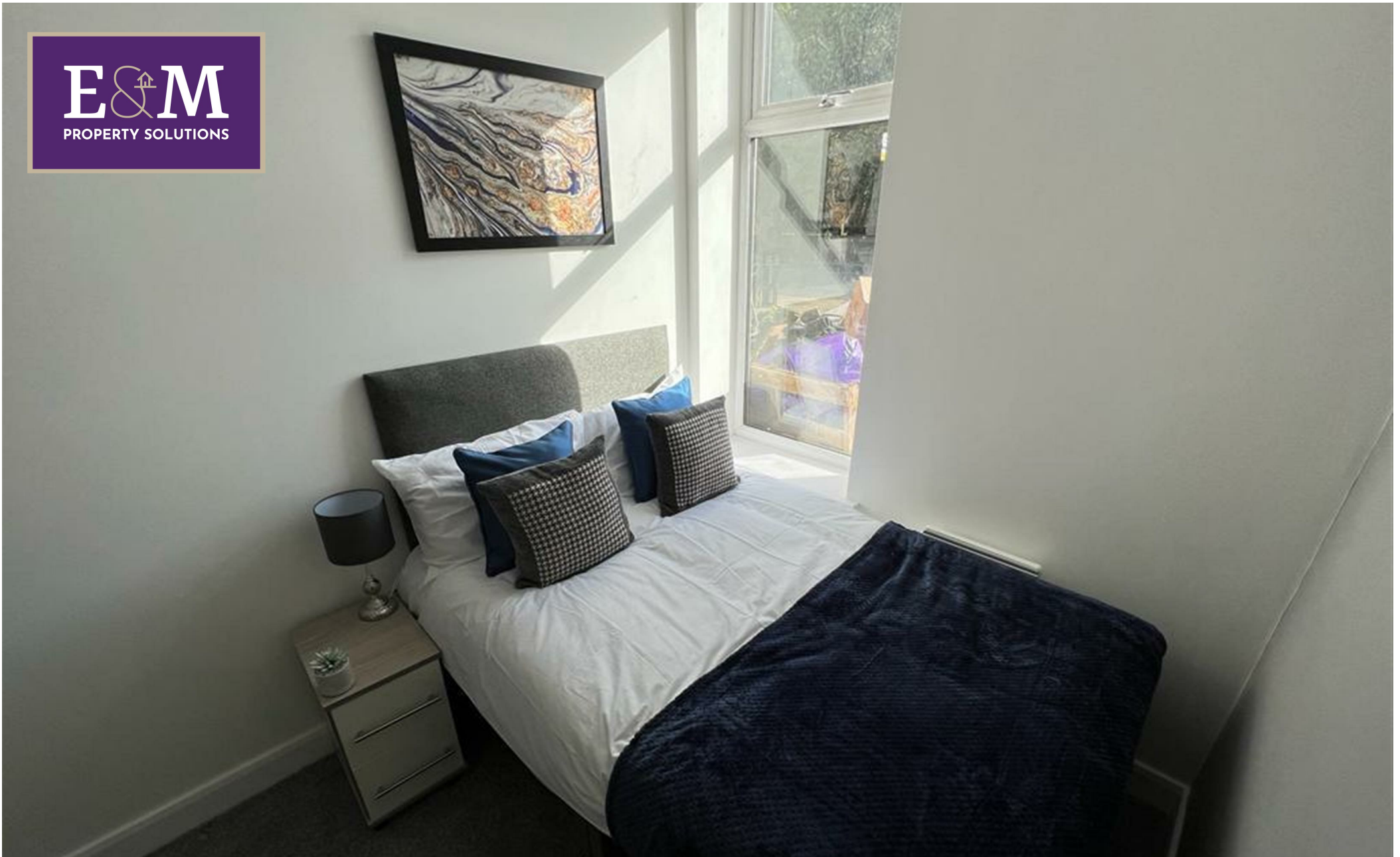
Room 2, 79-81 Church Street, Burnley, Lancashire, BB11 2RS £140 Per week