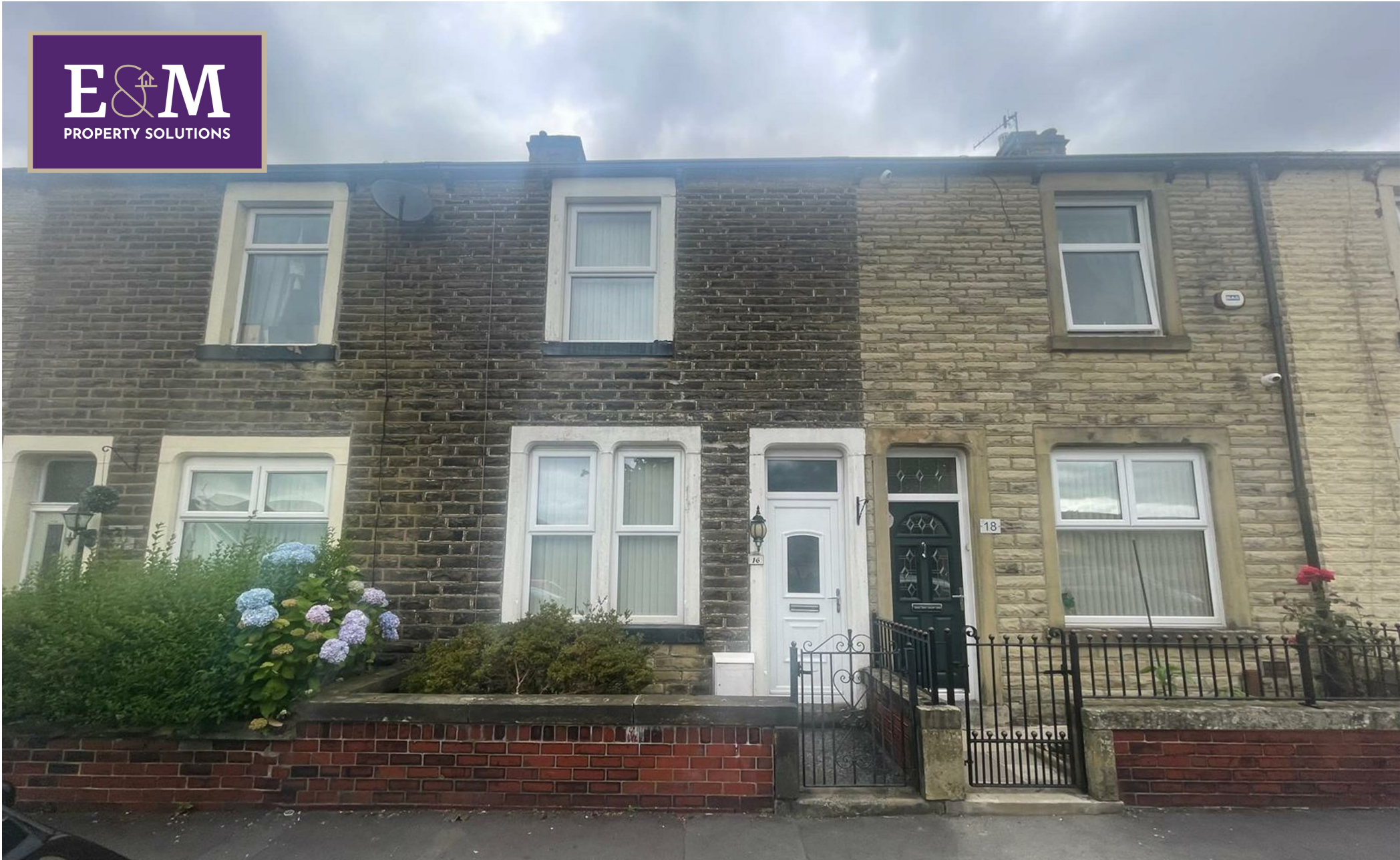
16 Peart Street, Burnley, BB10 1EP Asking price £89,995