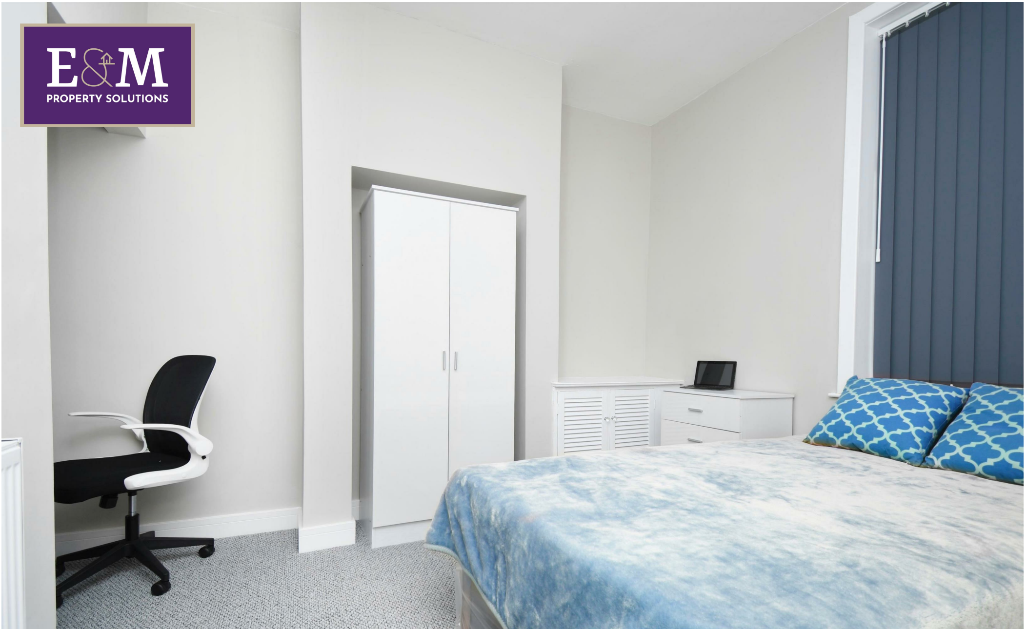
Room 1, 12 Ulster Street, Burnley, Lancashire, BB11 4NX £120 Per week