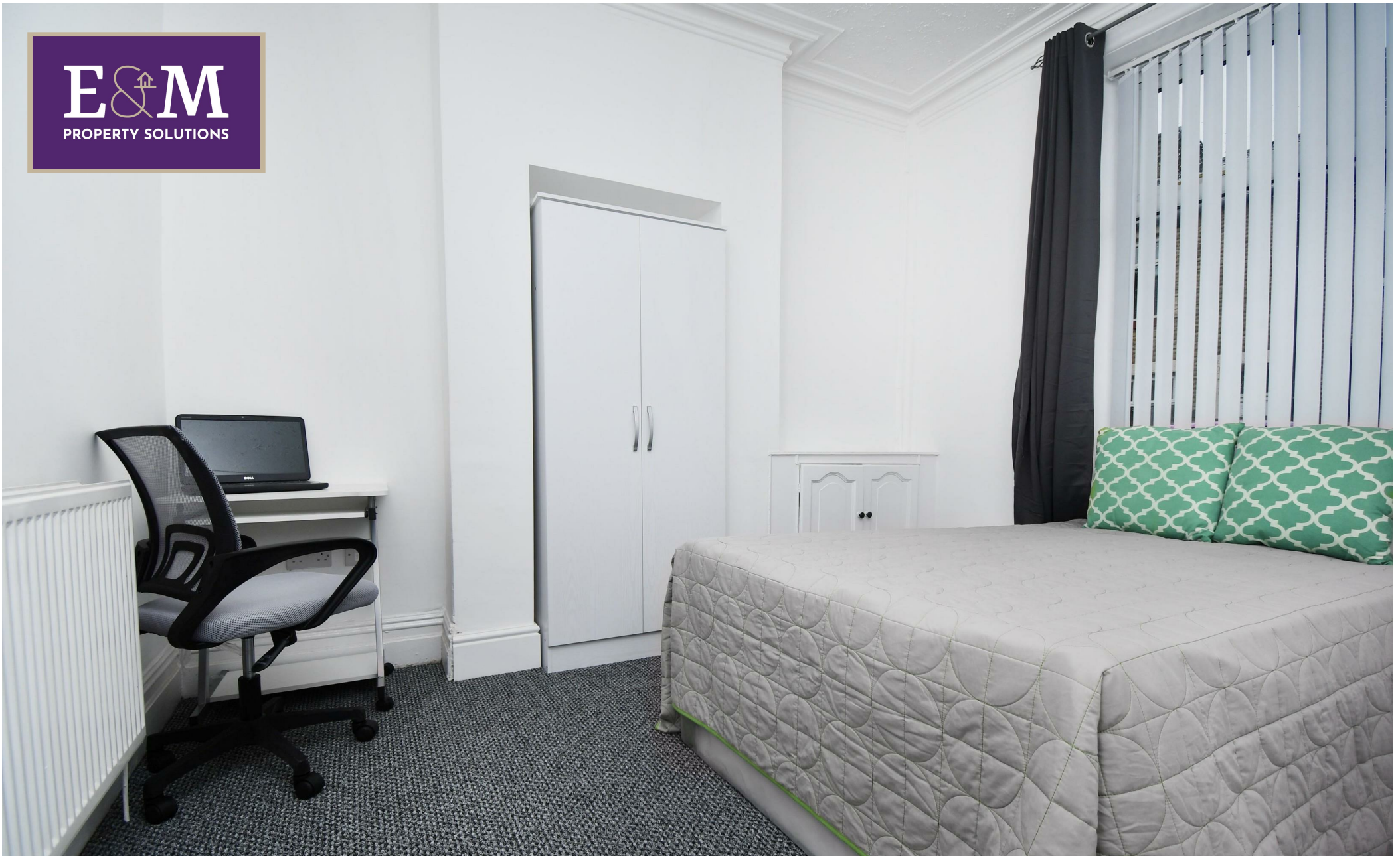
Room 1, 16 Linden Street, Burnley, Lancashire, BB10 4EQ £90 Per week