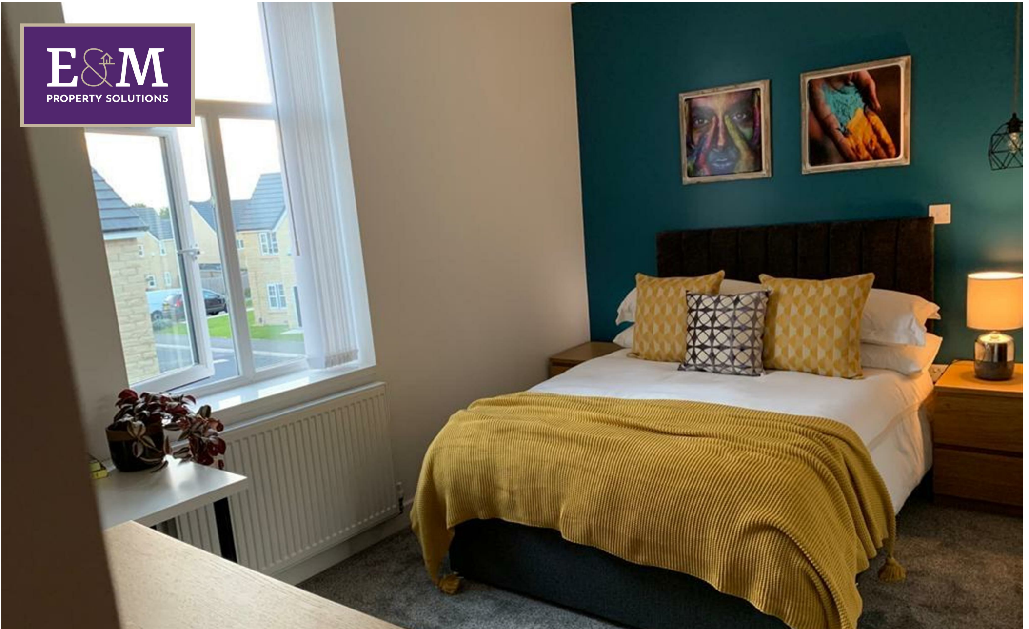
Room 2, 2 Bruce Street, Burnley, Lancashire, BB11 4BL £140 Per week