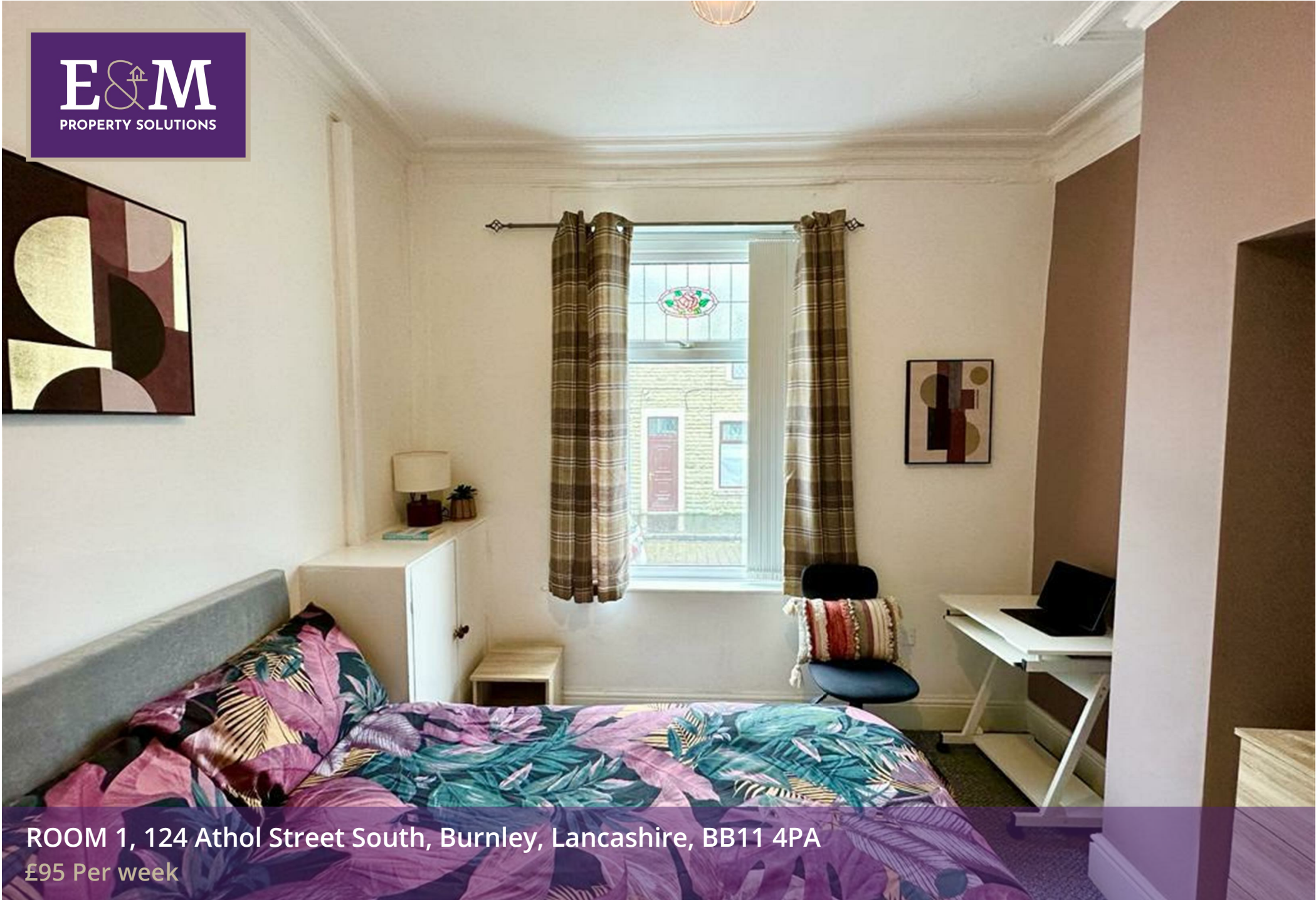
ROOM 1, 124 Athol Street South, Burnley, Lancashire, BB11 4PA £95 Per week