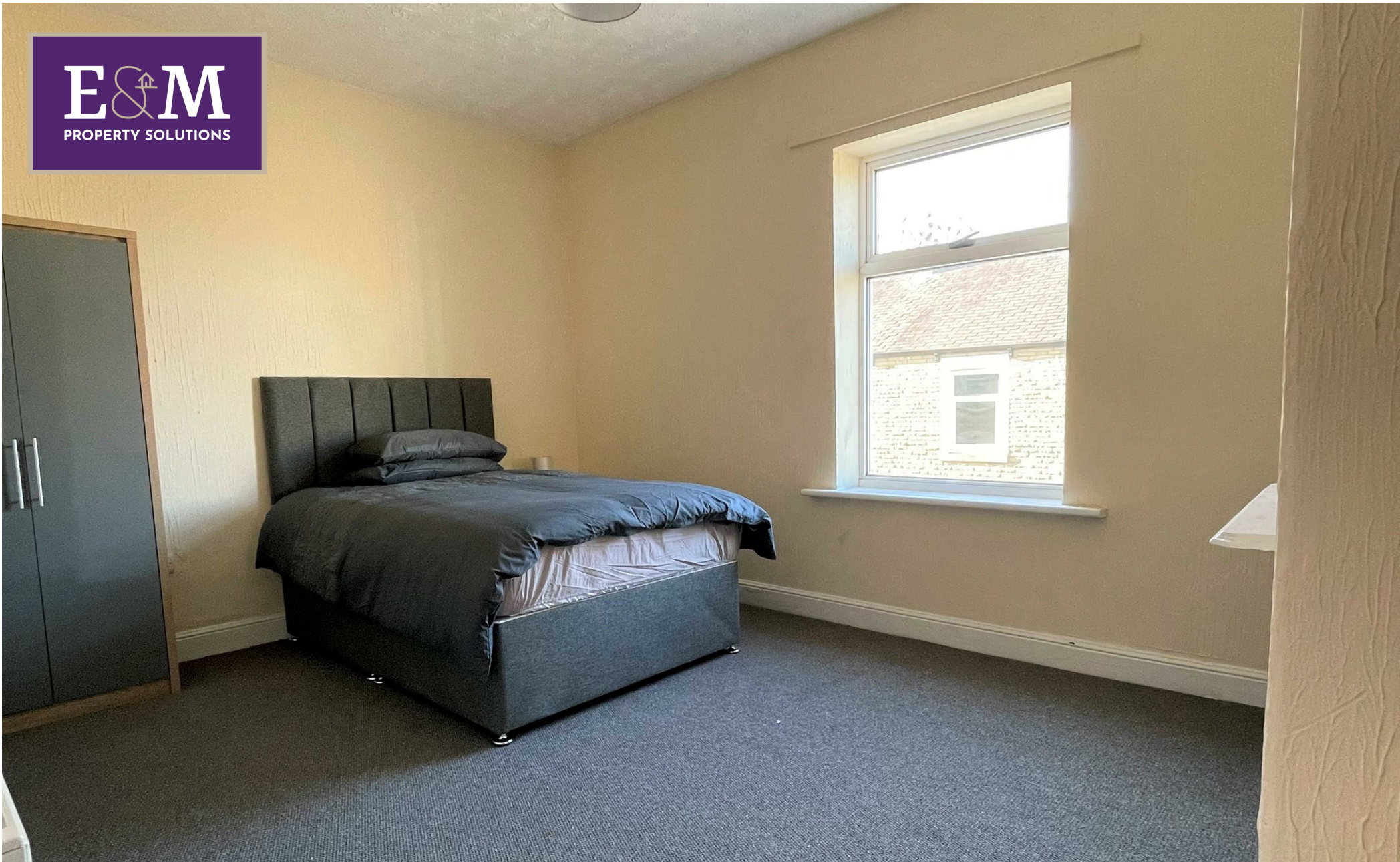
Room 2, 108 Nairne Street, Burnley, Lancashire, BB11 4PD £130 Per week