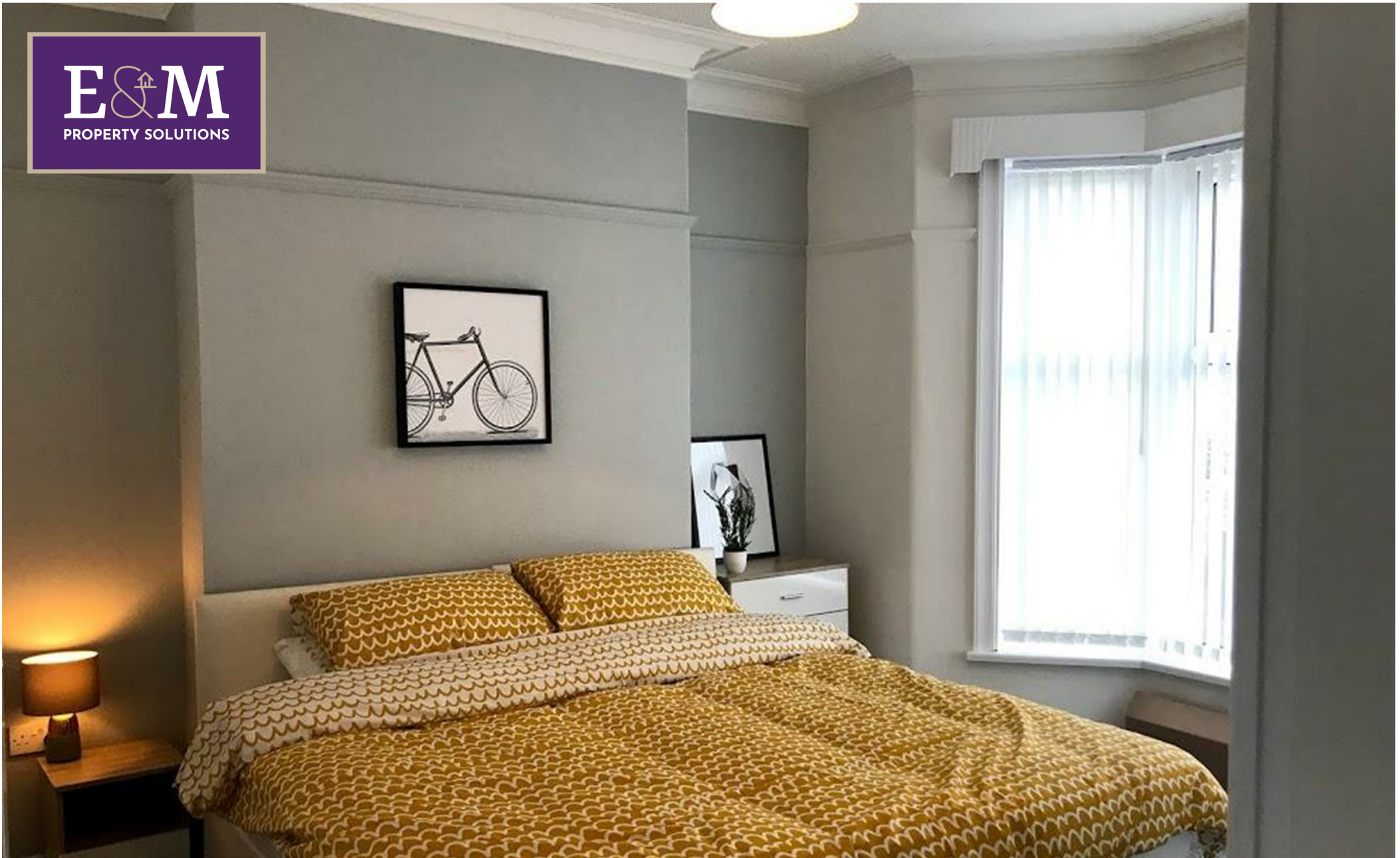
Room 1, 227 Coal Clough Lane, Burnley, Lancashire, BB11 4DL £100 Per week