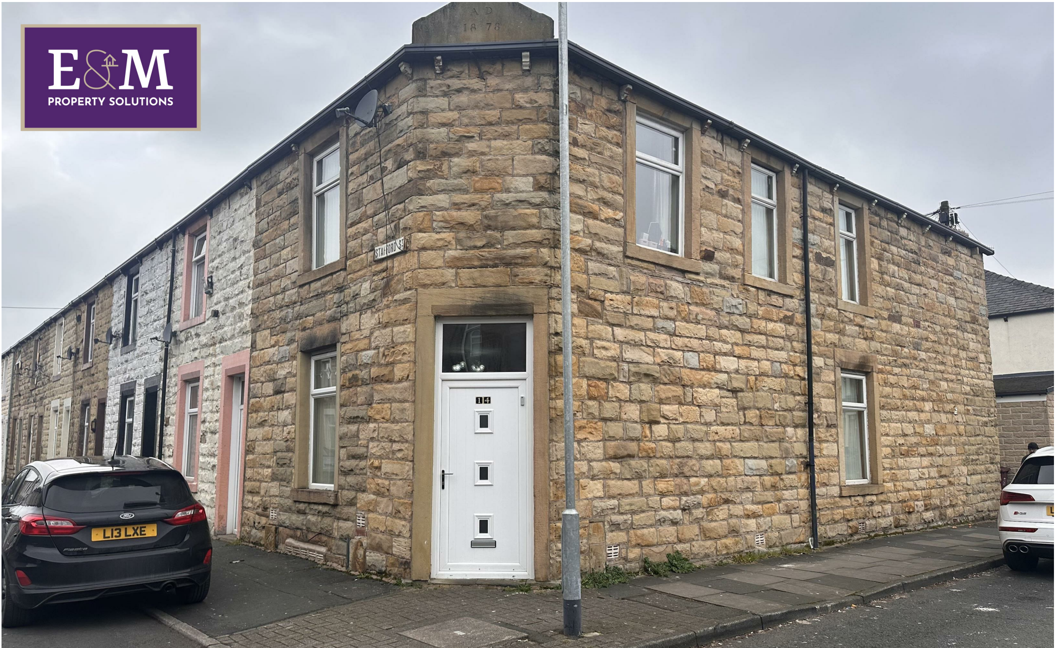
14 Elm Street, Burnley, BB10 1AJ Price £135,000