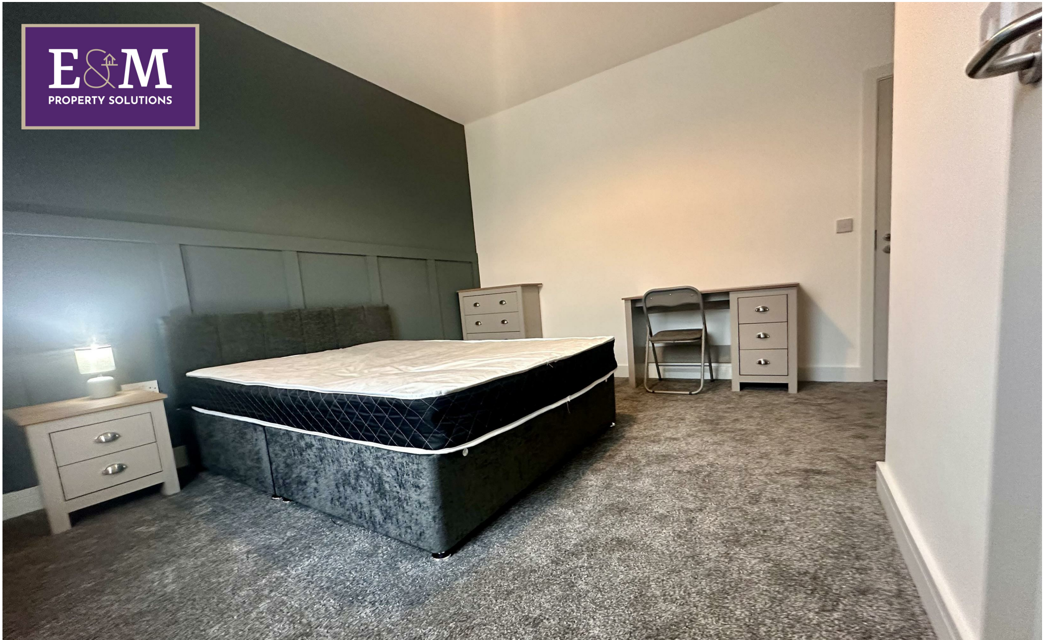
ROOM 4, 14 Bulcock Street, Burnley, Lancashire, BB10 1UH £120 Per week