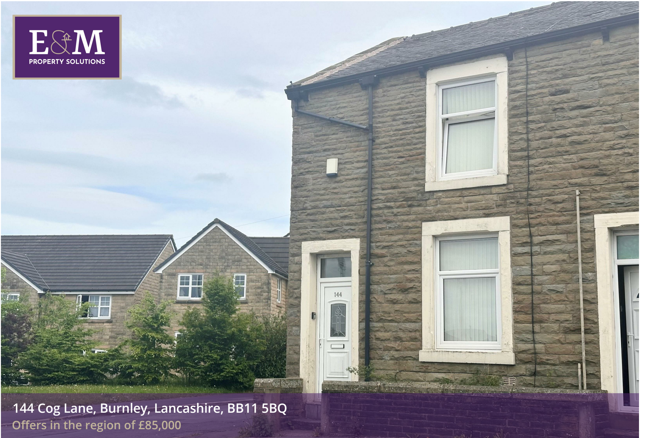
144 Cog Lane, Burnley, Lancashire, BB11 5BQ Offers in the region of £85,000