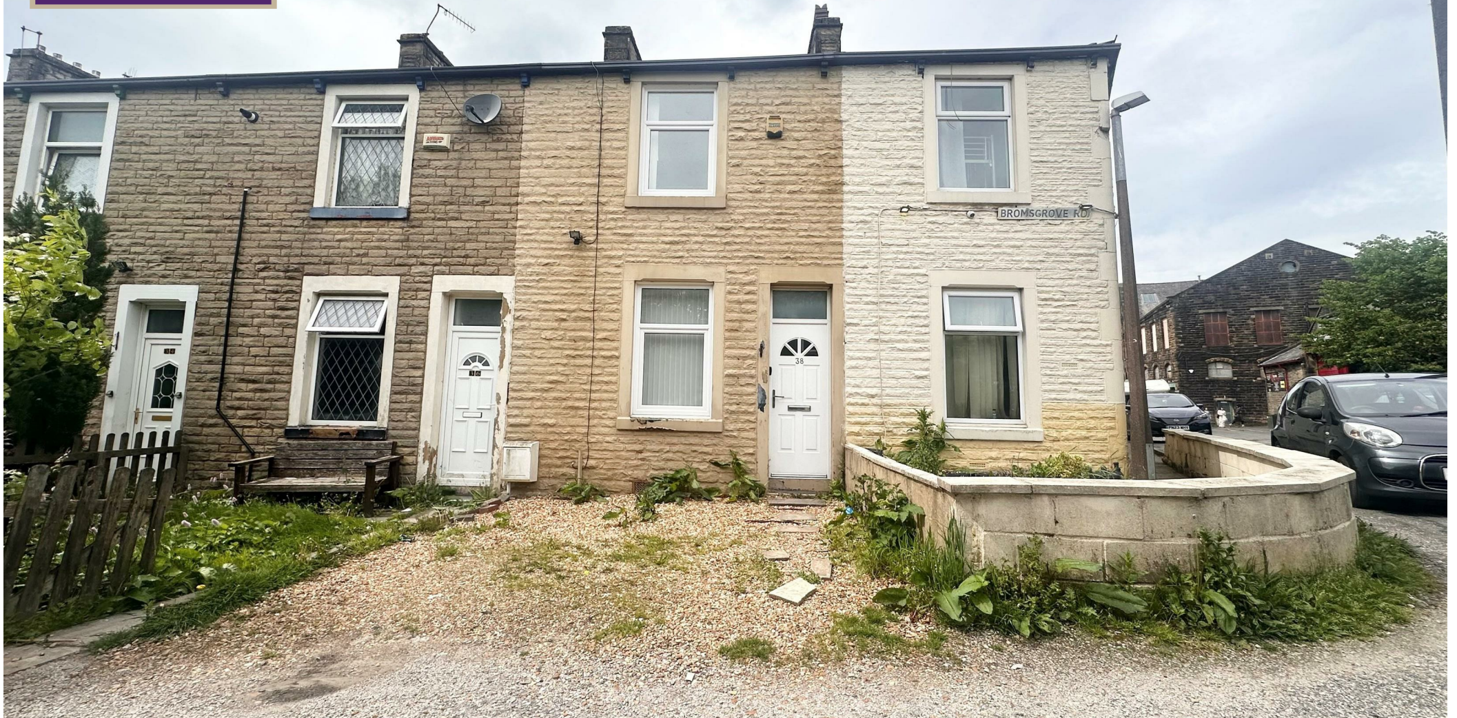
38 Bromsgrove Road, Burnley, Lancashire, BB10 3BG Asking price £85,000