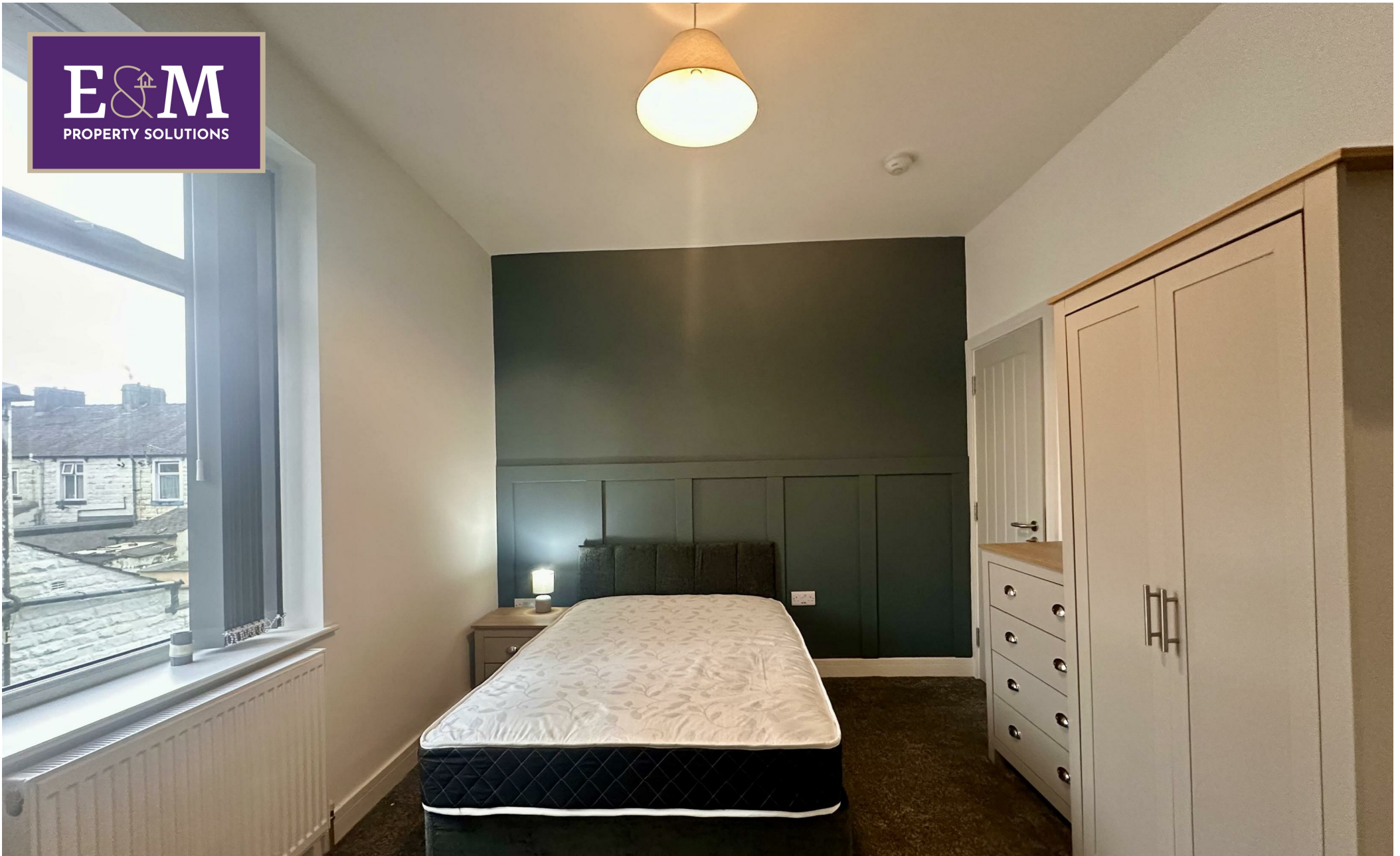
ROOM 2, 14 Bulcock Street, Burnley, Lancashire, BB10 1UH £120 Per week