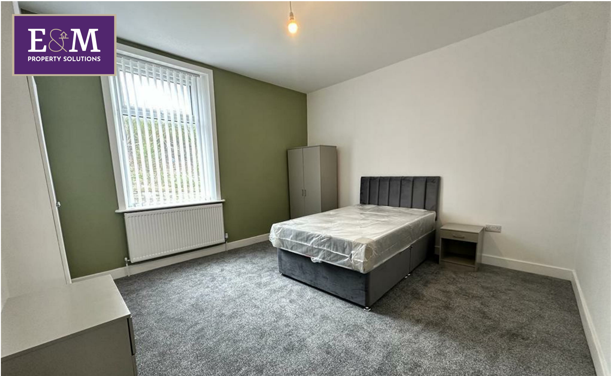
Room 4, 114 Hollingreave Road, Burnley, BB11 2HU £120 Per week