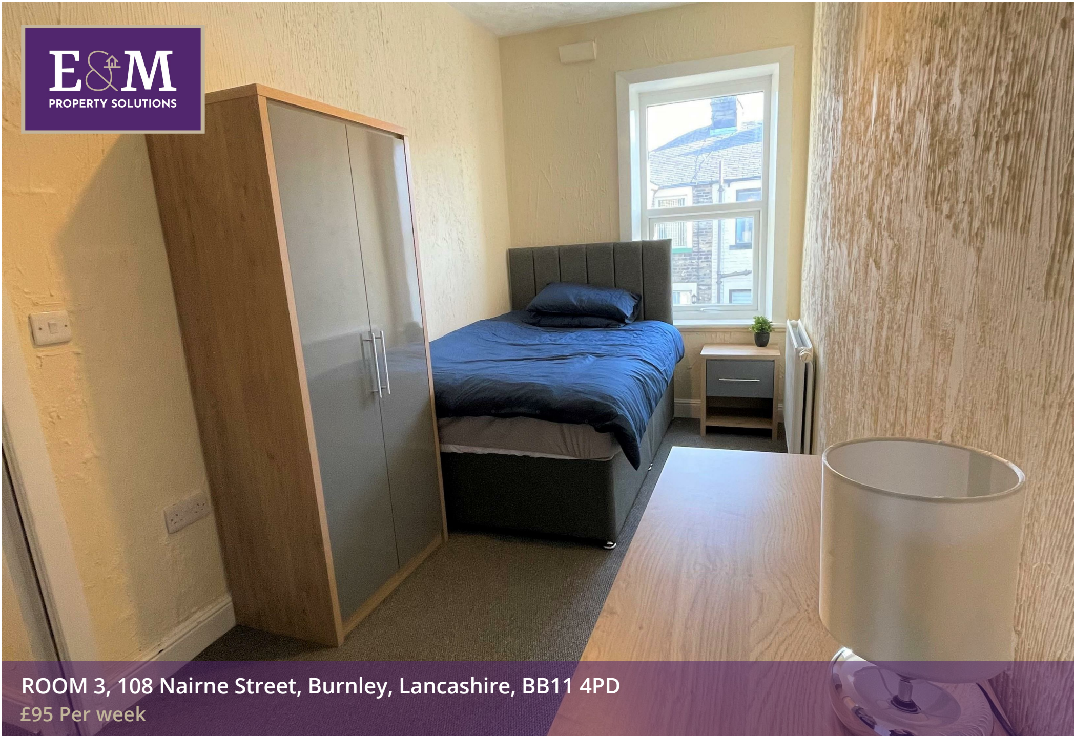
ROOM 3, 108 Nairne Street, Burnley, Lancashire, BB11 4PD £95 Per week