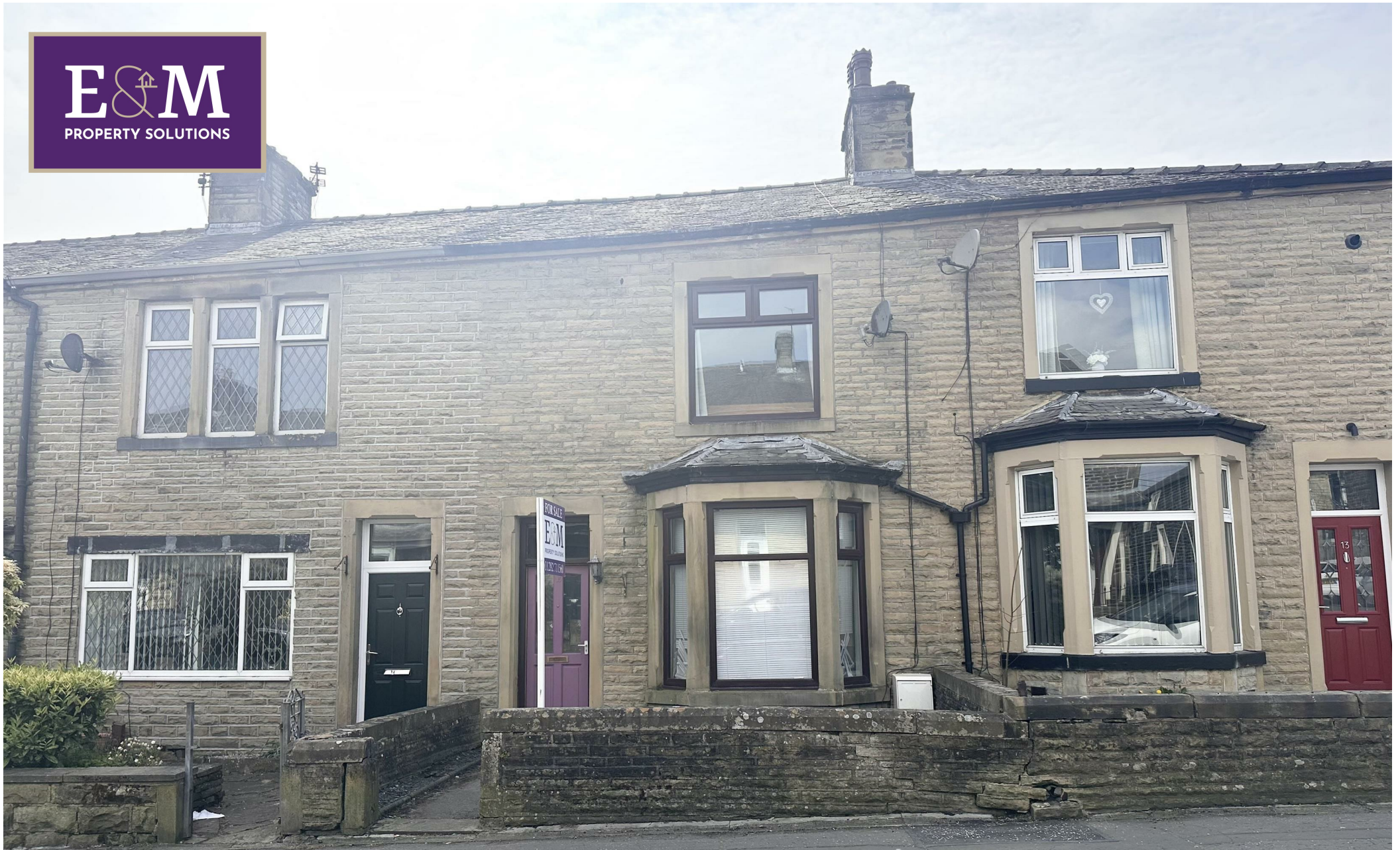
15 Queen Street, Burnley, Lancashire, BB10 2HE Offers in the region of £135,000