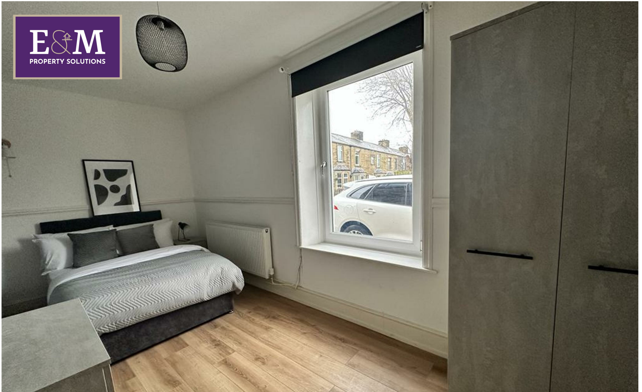
ROOM 2, 2-4 Collinge Street, Padiham, Burnley, Lancashire, BB12 7BA £95 Per week