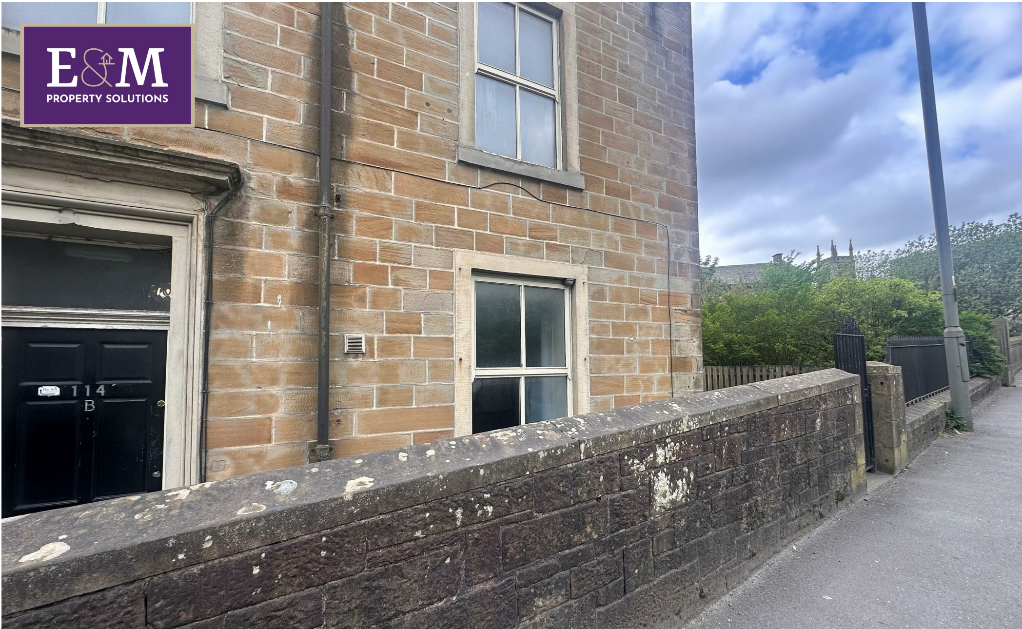
114C Westgate, Burnley, BB11 1SD Asking price £40,000