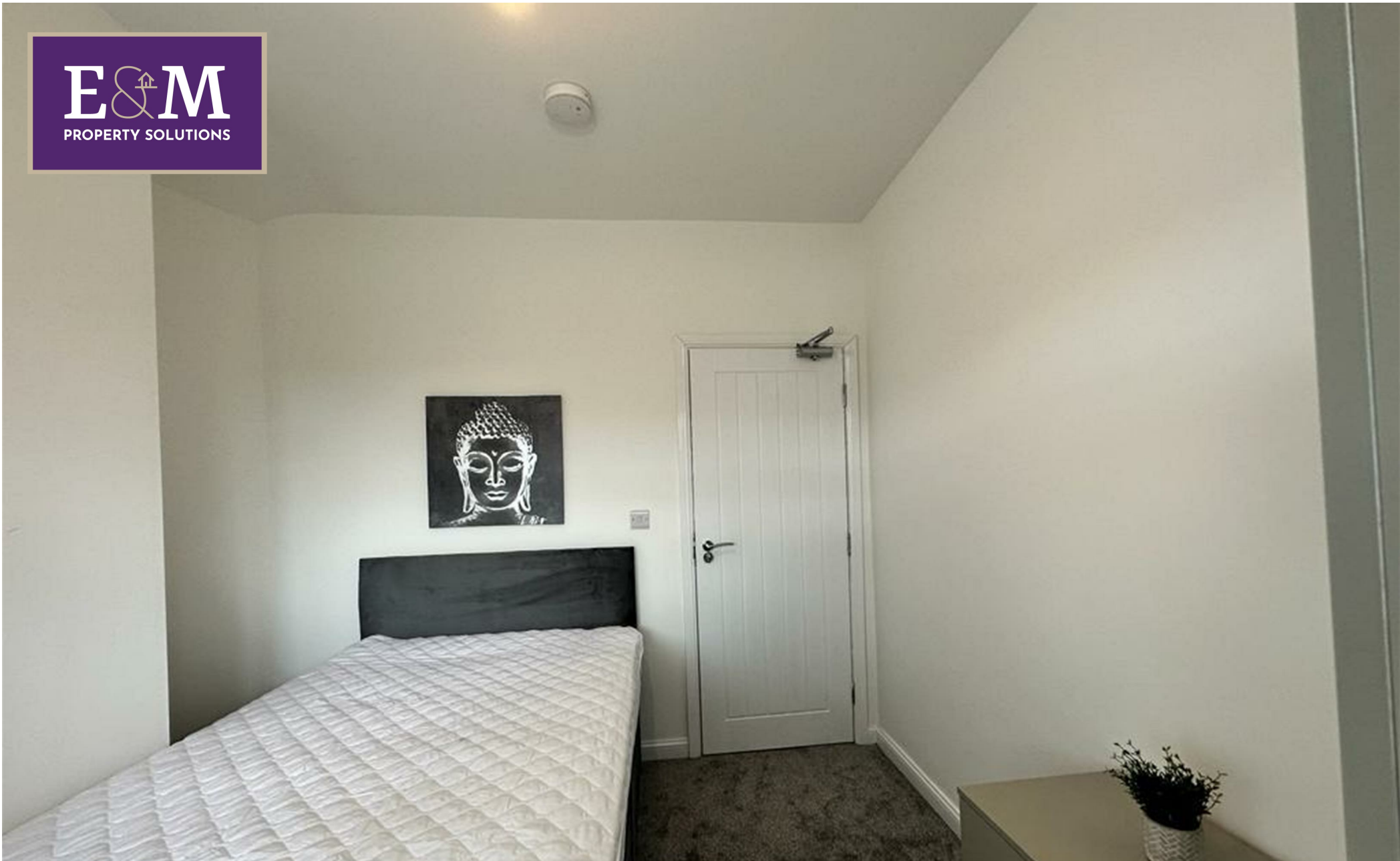
ROOM 4, 369 Brunshaw Road, Burnley, Lancashire, BB10 3HX £115 Per week