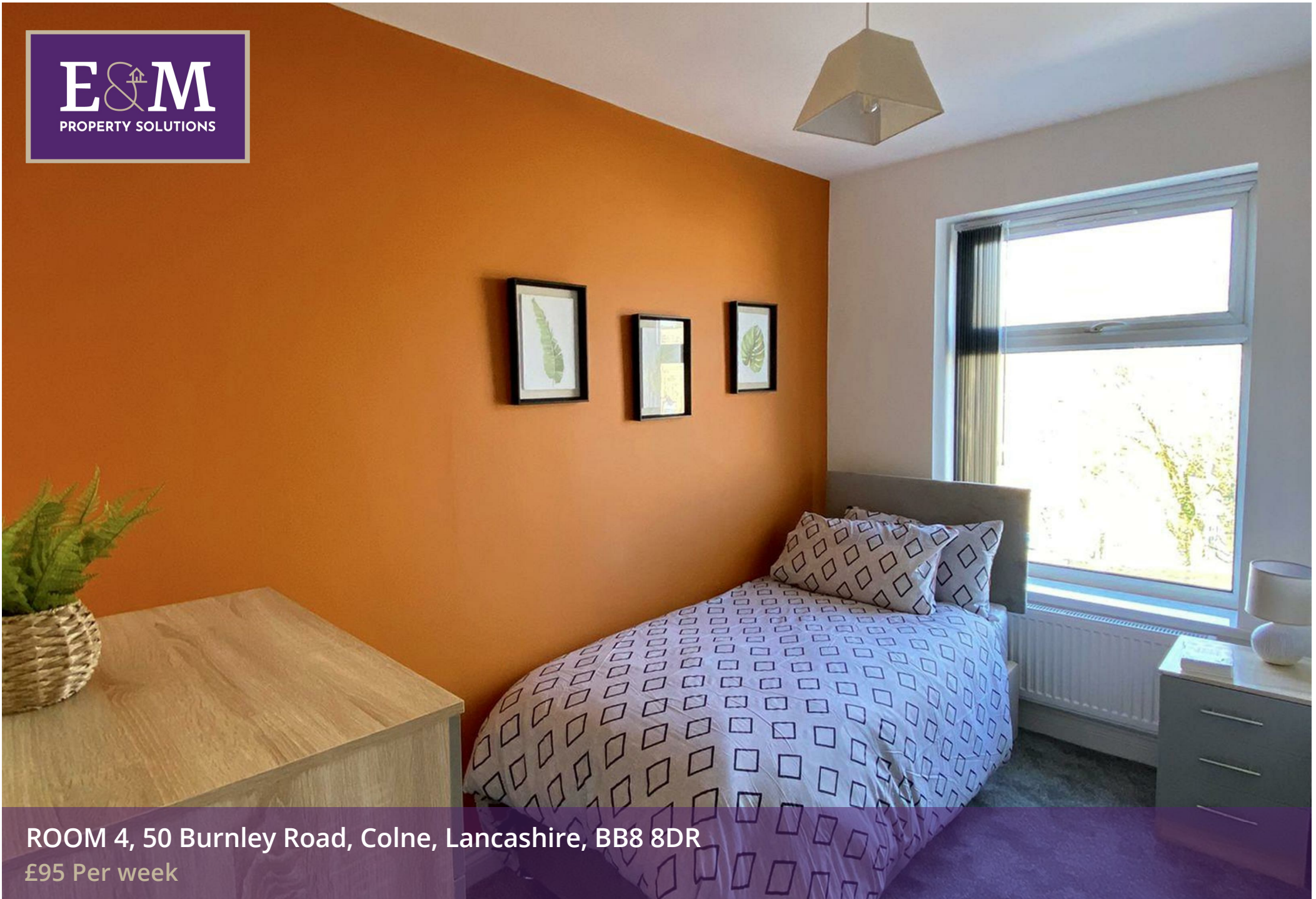
ROOM 4, 50 Burnley Road, Colne, Lancashire, BB8 8DR £95 Per week