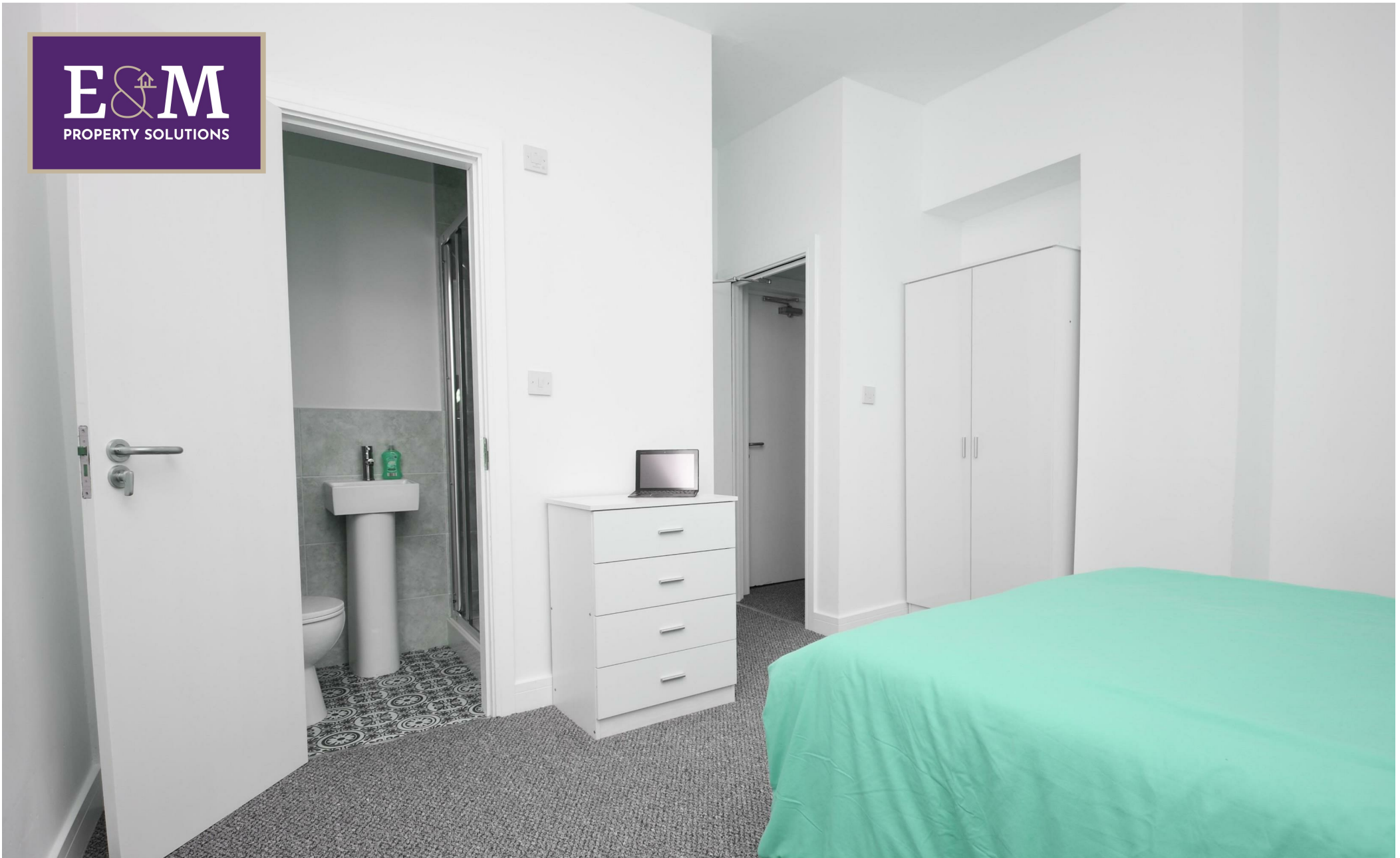
Room 6, 2-4 Fir Street, Burnley, Lancashire, BB10 4AL £115 Per week