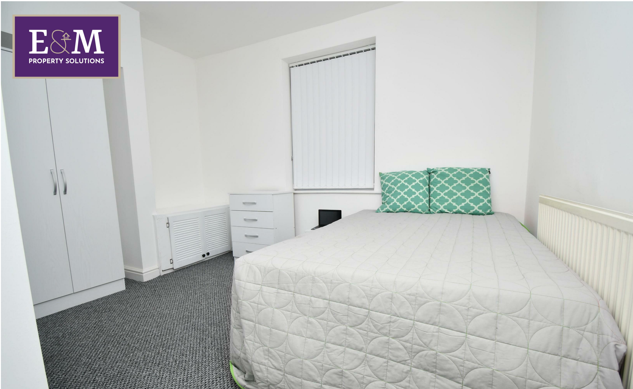
ROOM 1, 30 Kenmure Place, Preston, Lancashire, PR1 6DD £120 Per week