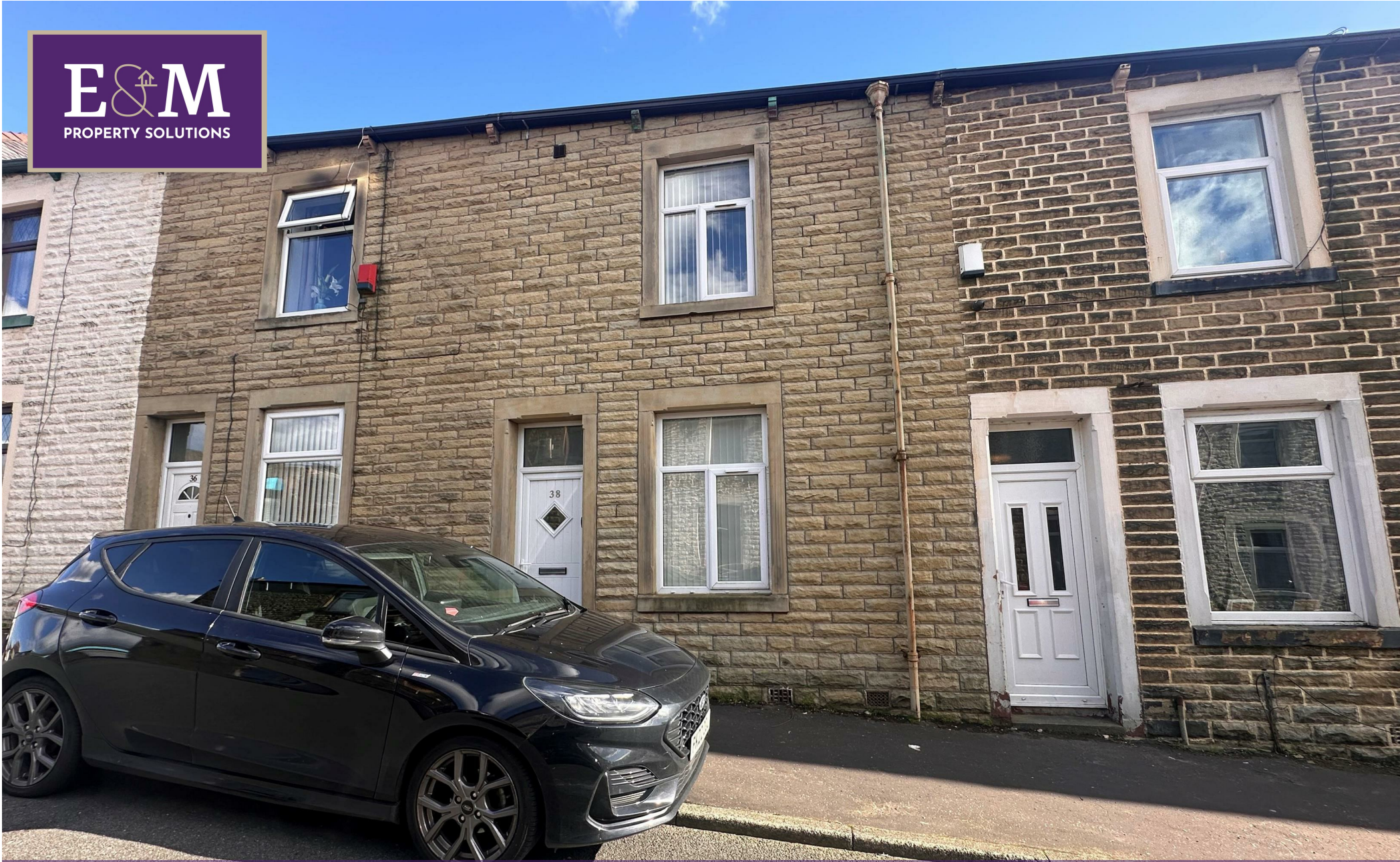
38 Prestwich Street, Burnley, Lancashire, BB11 4NZ Offers in the region of £107,995