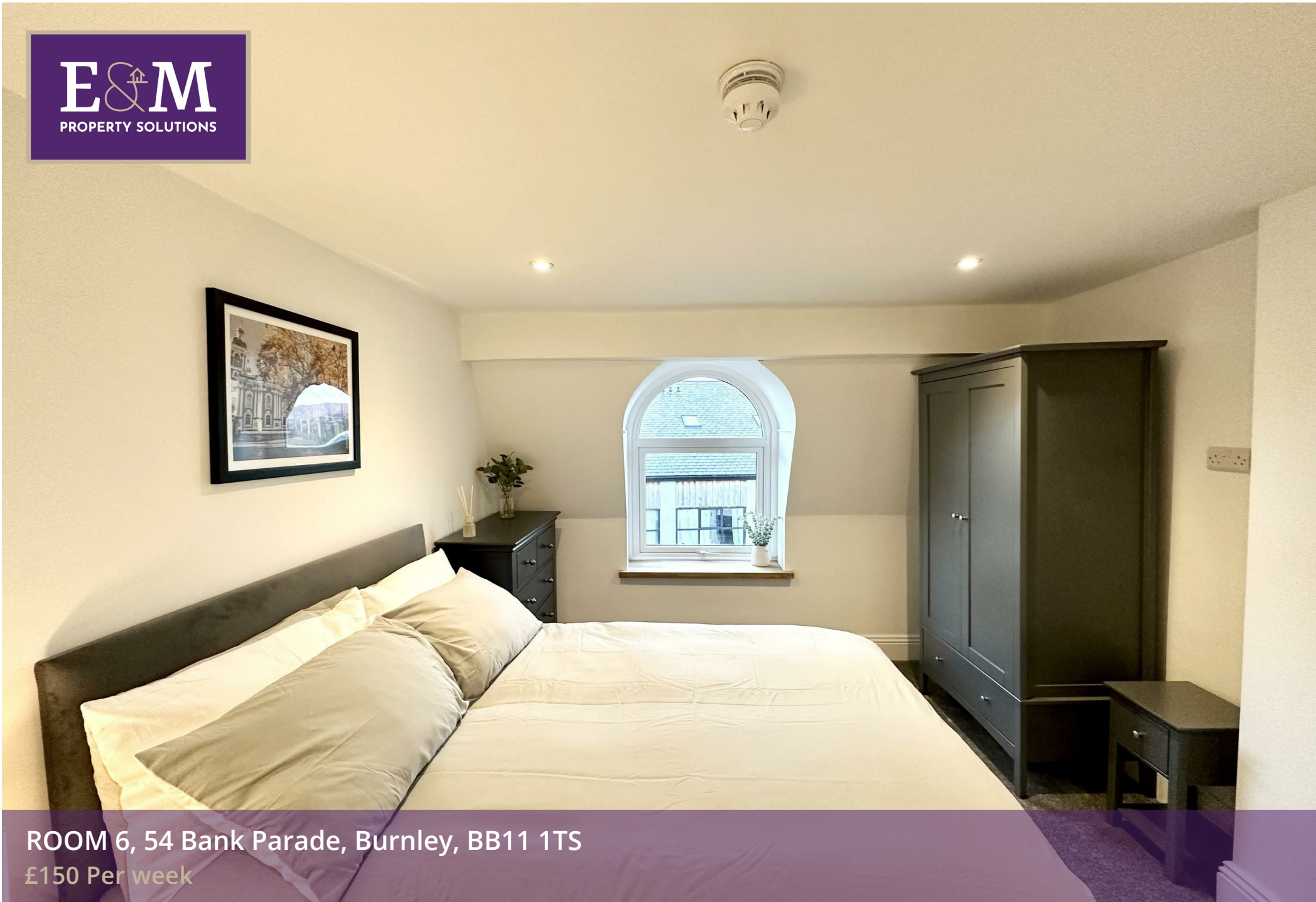
ROOM 6, 54 Bank Parade, Burnley, BB11 1TS £150 Per week