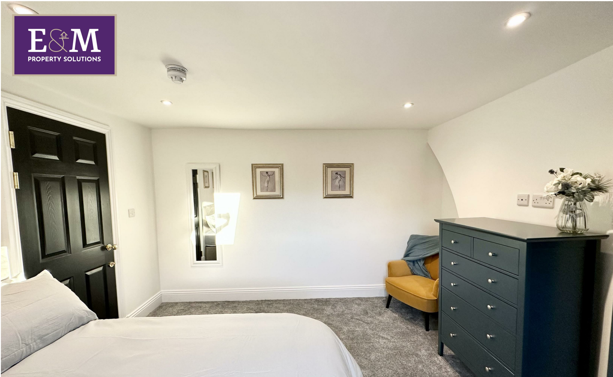
ROOM 5, 54 Bank Parade, Burnley, BB11 1TS £150 Per week