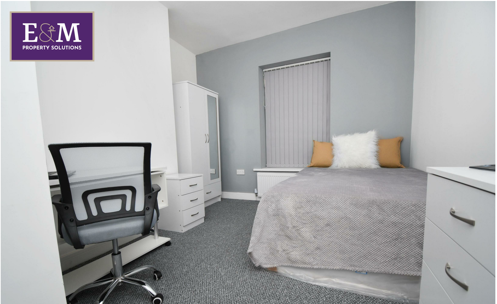
Room 4, 38 Queensberry Road, Burnley, Lancashire, BB11 4LH £125 Per week