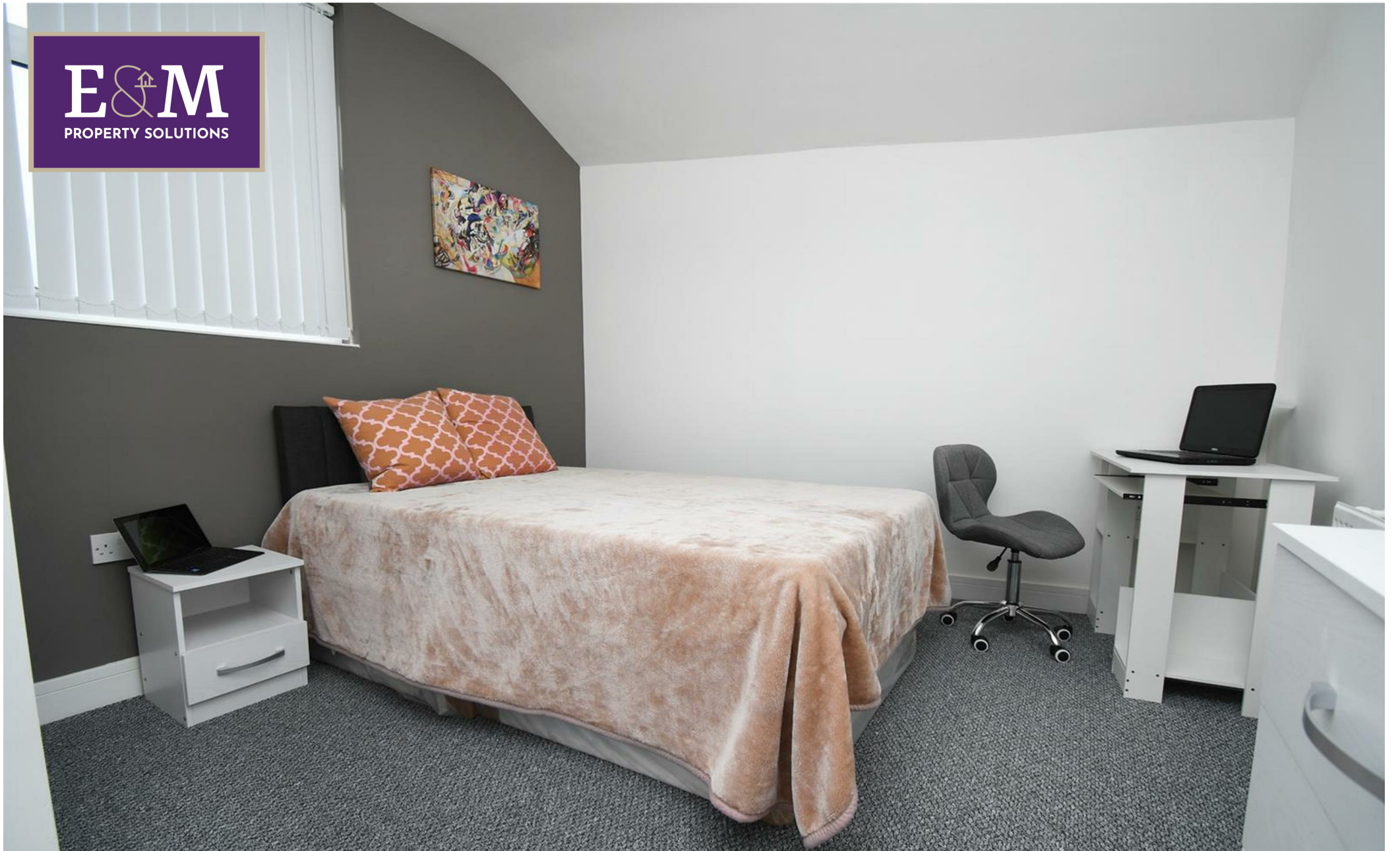
Room 2, 8 Christian Road, Preston, Lancashire, PR1 8NB £130 Per week