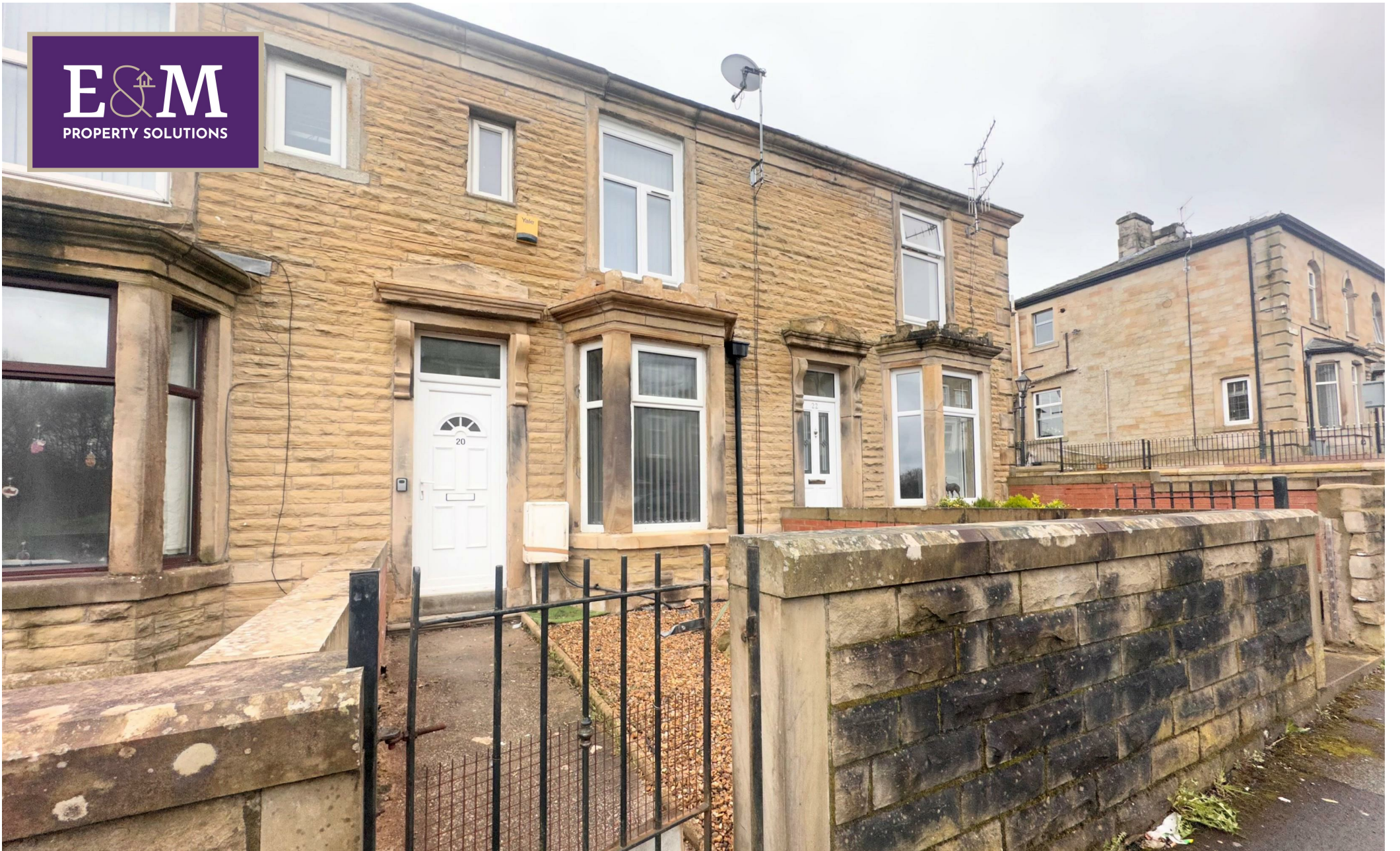
20 Accrington Road, Burnley, BB11 4AW £675 Per month