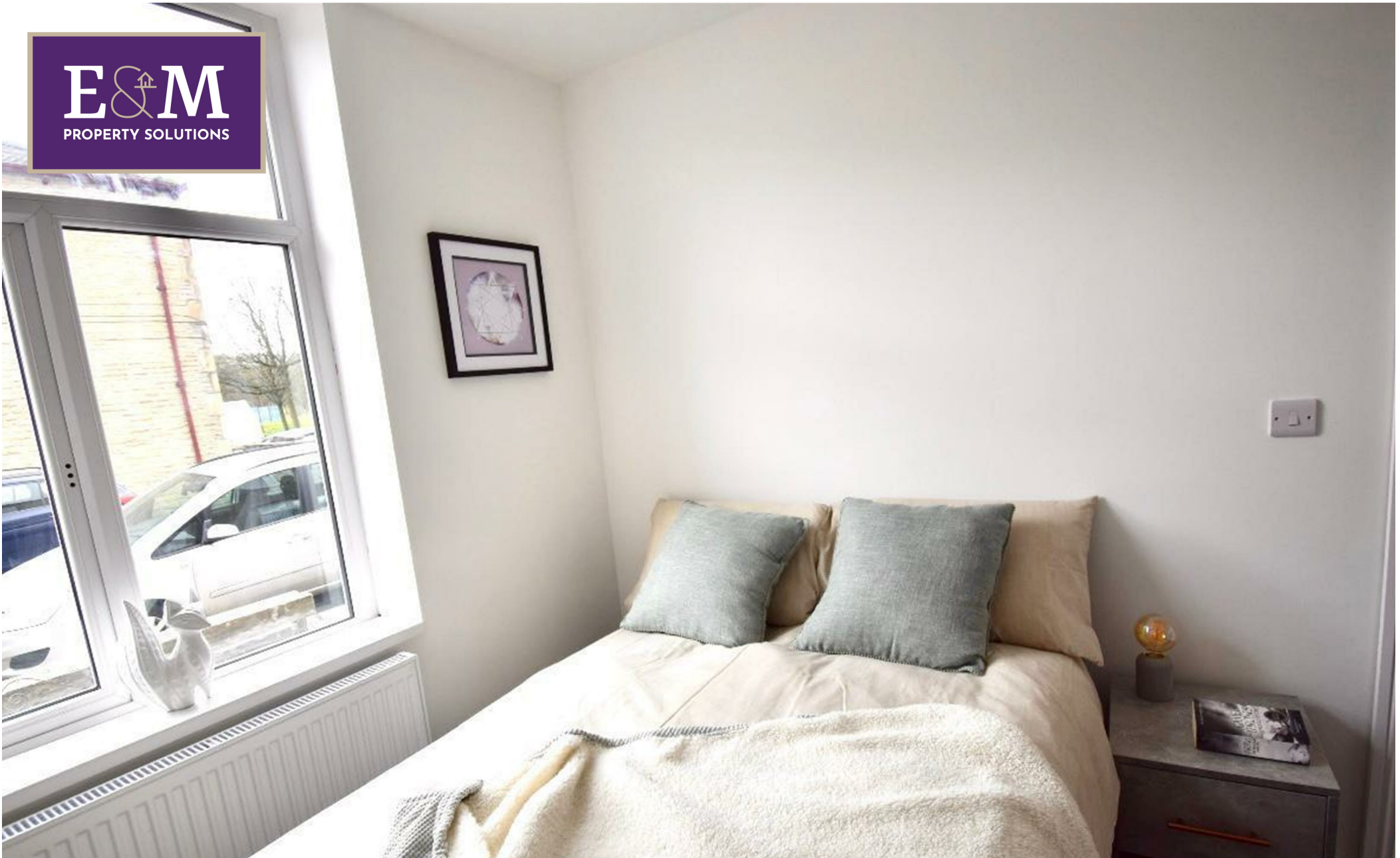
Room 1, 4 Brockenhurst Street, Burnley, Lancashire, BB10 4ET £412 Per month