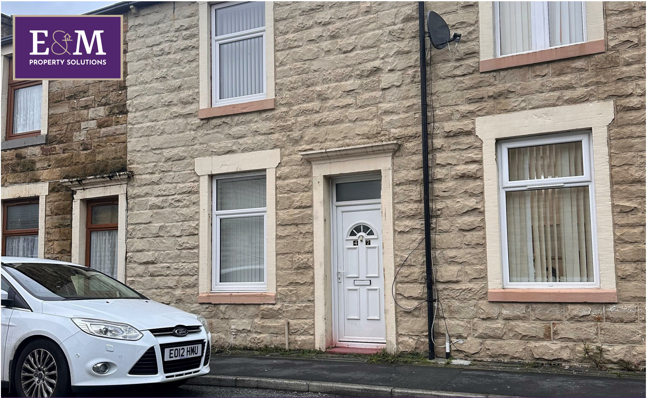
47 Brennand Street, Burnley, Lancashire, BB10 1SU Asking price £94,995