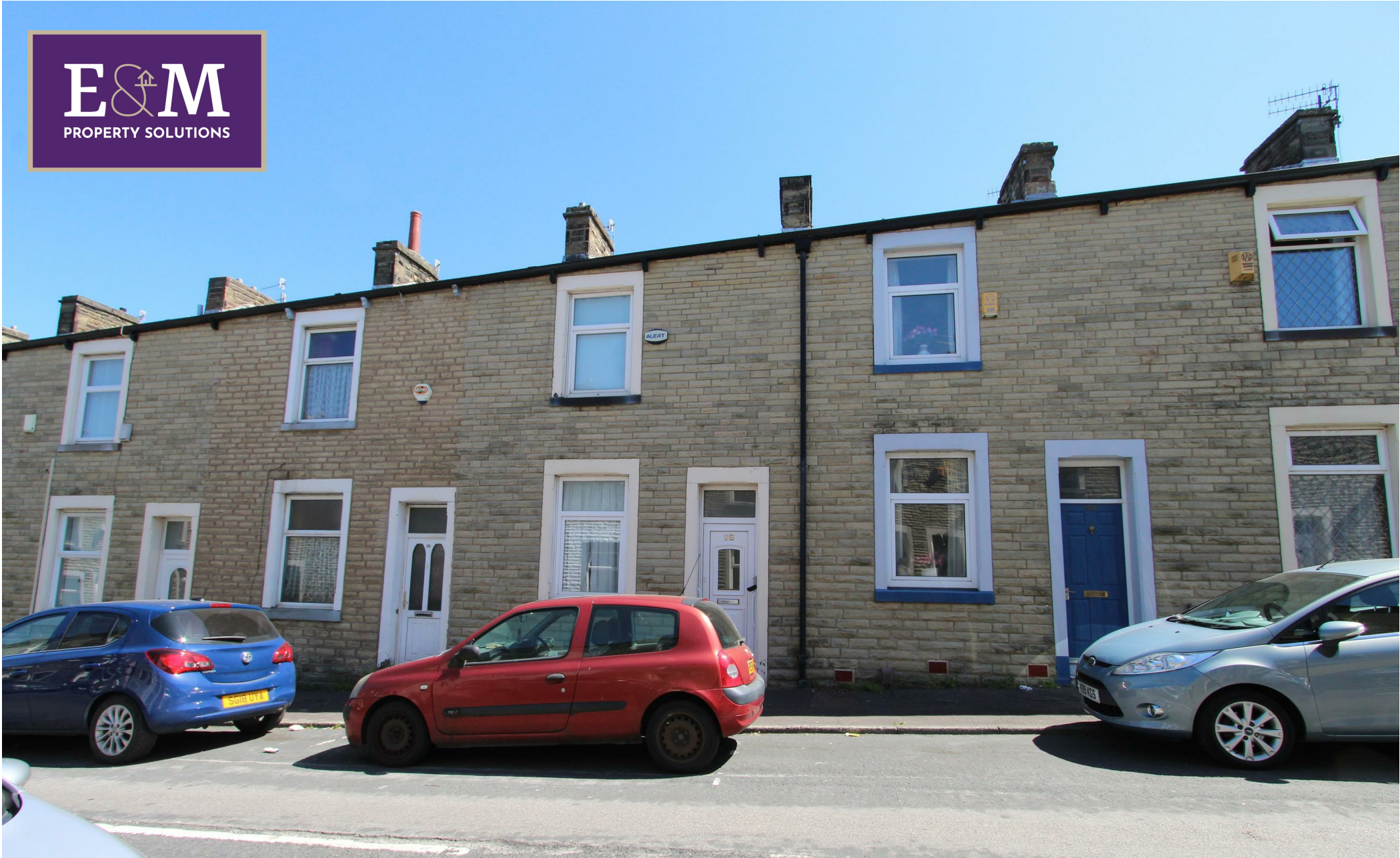
98 Nairne Street, Burnley, Lancashire, BB11 4PE Offers in the region of £79,999