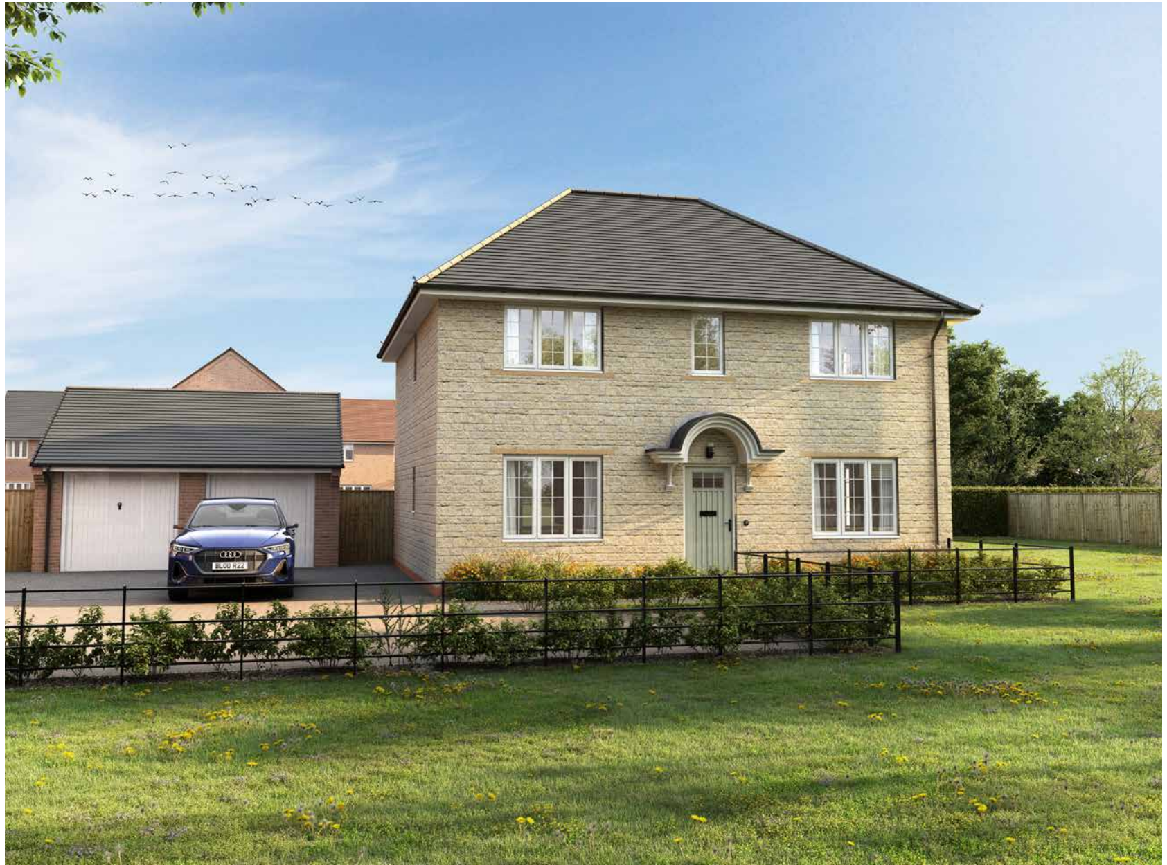
↳ Artists impression of The Dorneywood