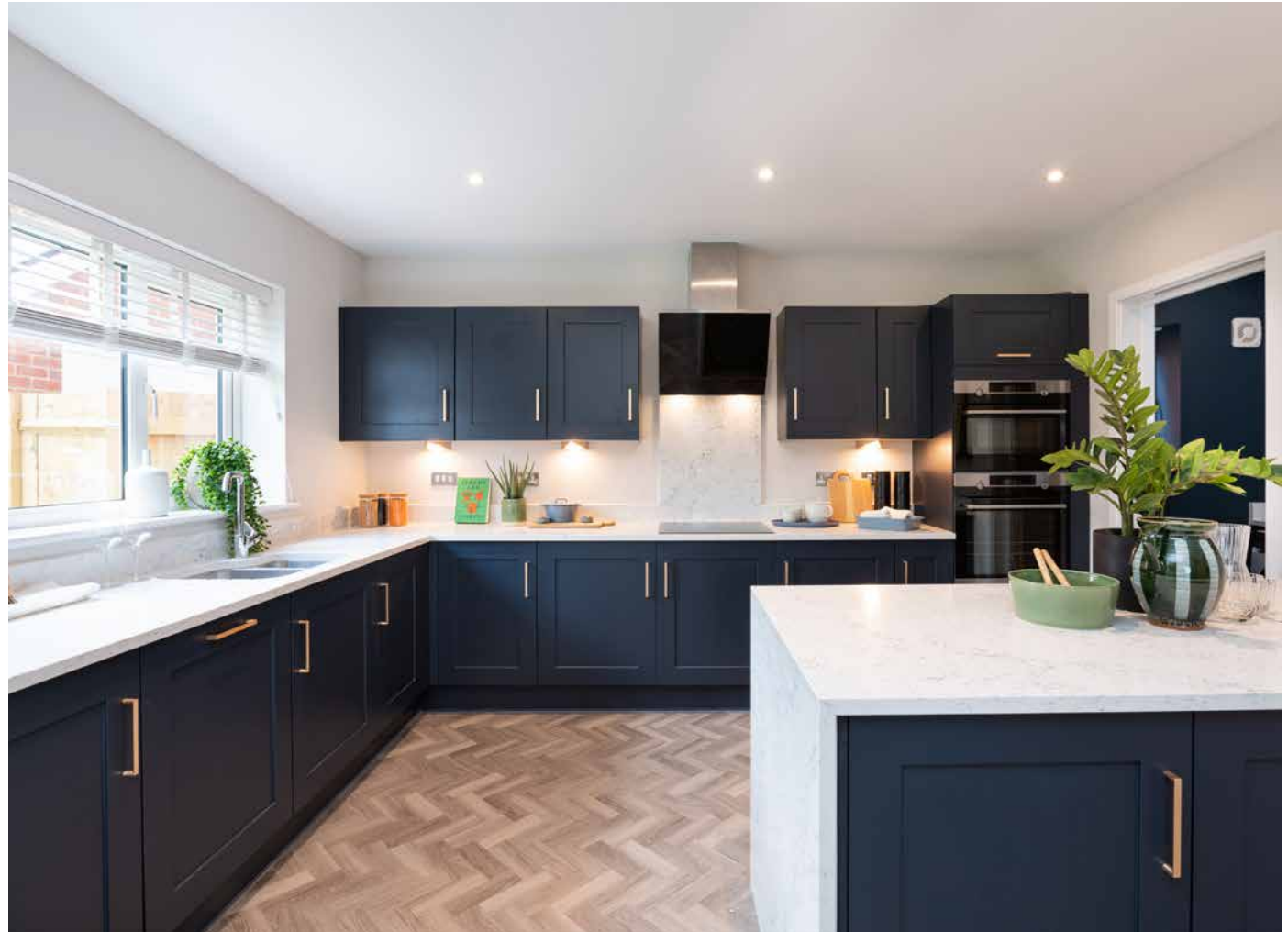
↳ Typical Dorneywood kitchen interior with upgrades