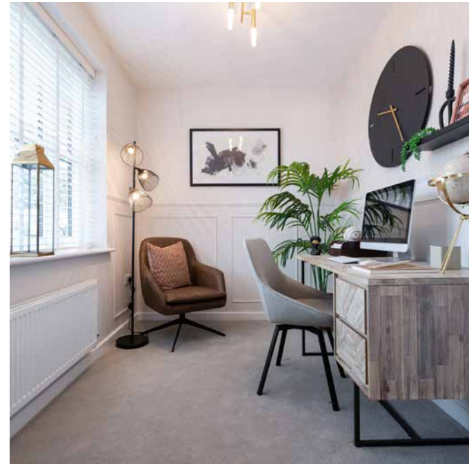
↳ Premium finishes with upgrades