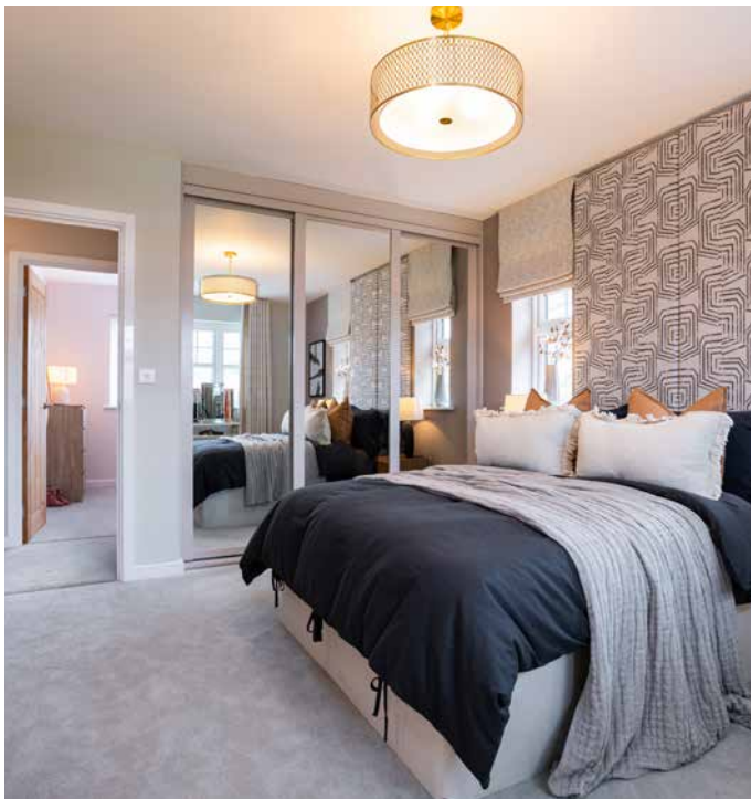
↳ Typical Dorneywood bedroom