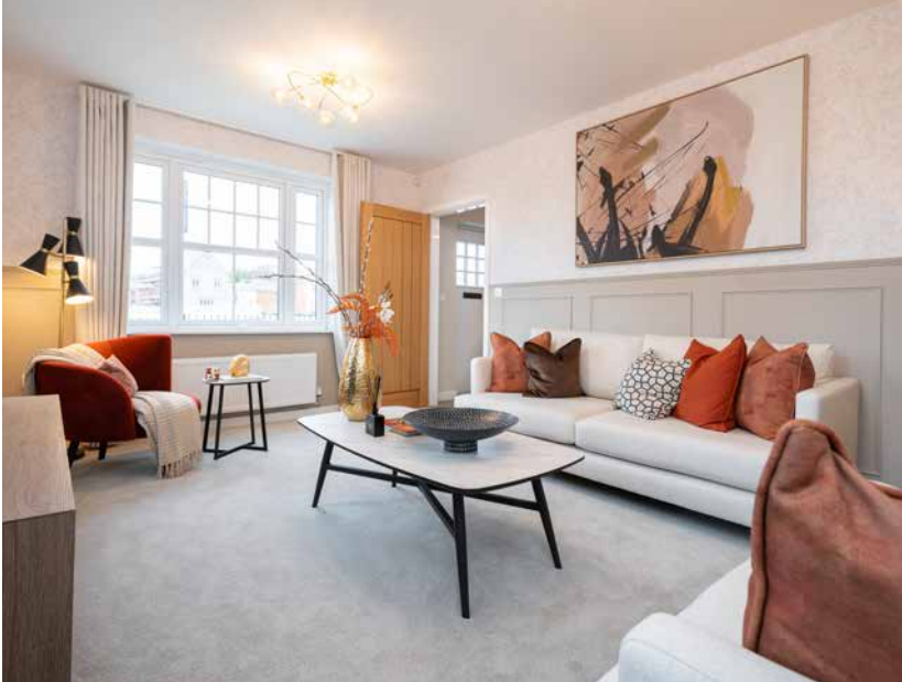
↳ Typical interiors of The Dorneywood lounge & kitchen