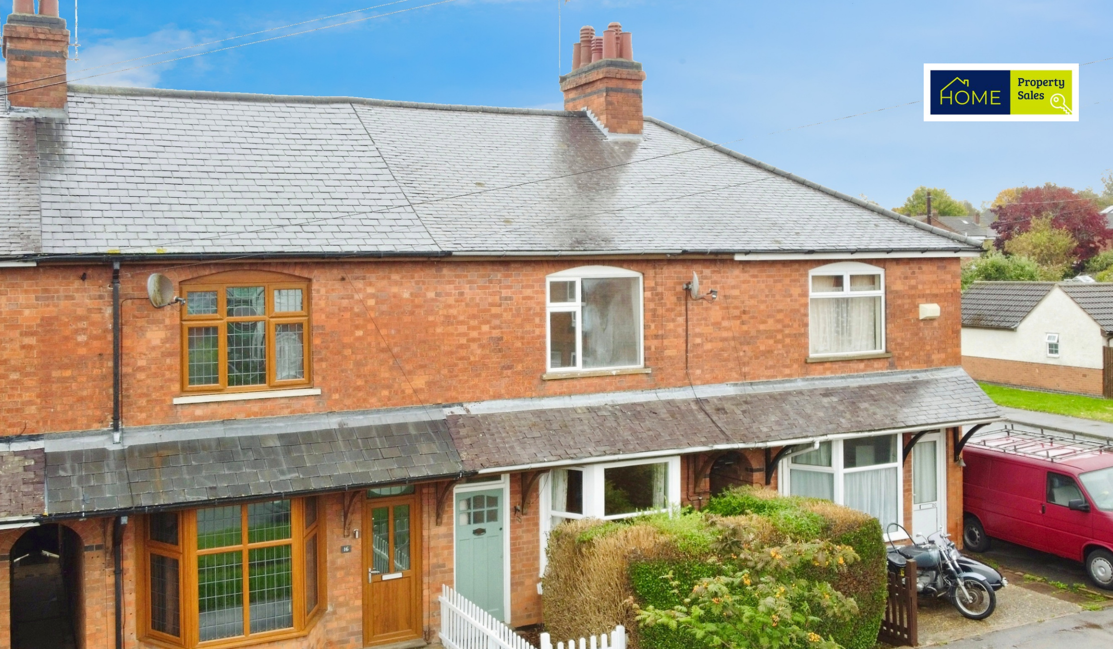
2 Bedroom Appealing Mid Terrace House 18 Lea Close Thurmaston, LE4 8DW