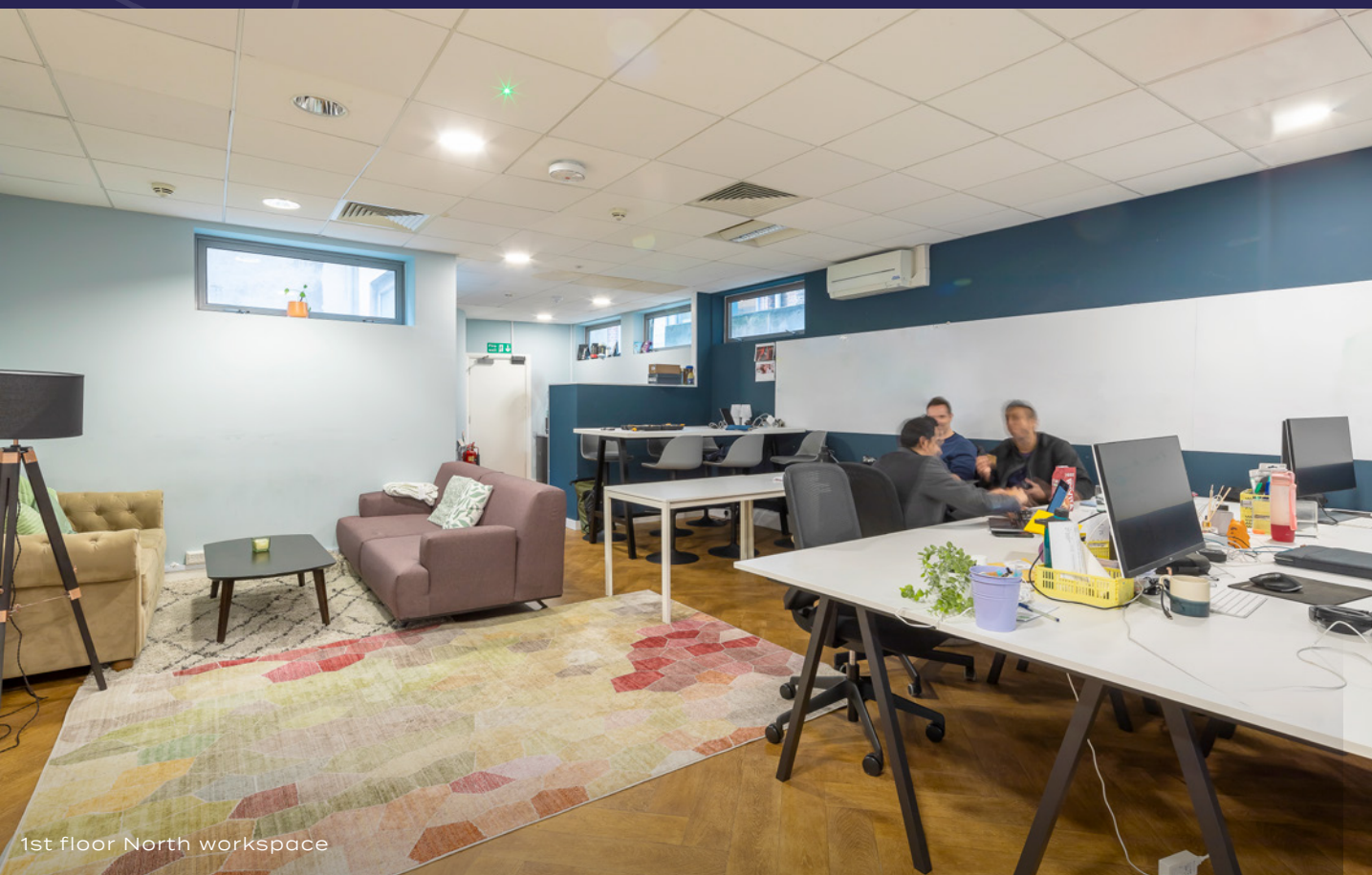
1st floor North workspace