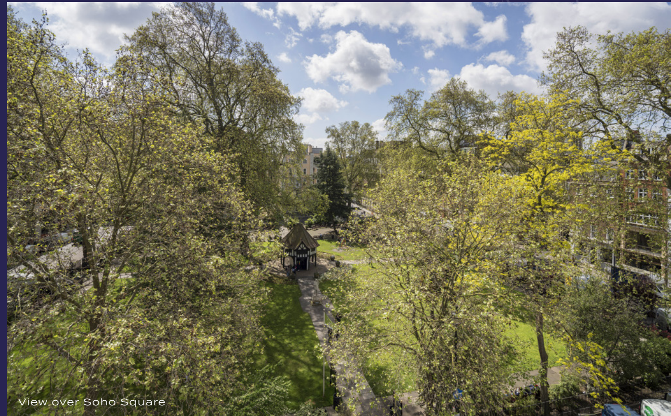
View over Soho Square