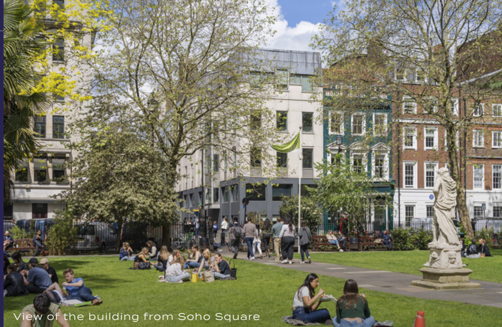
View of the building from Soho Square