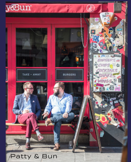
Patty & Bun