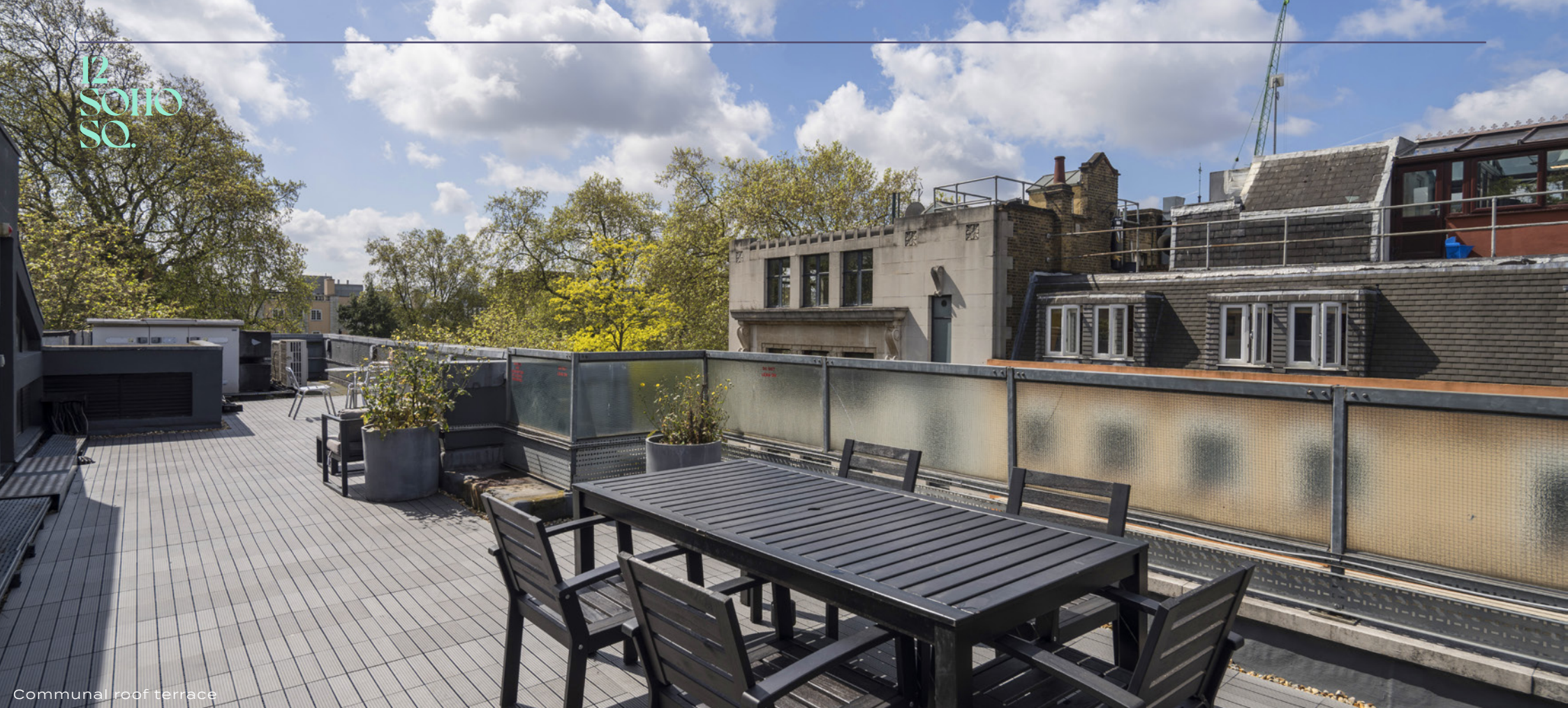
Communal roof terrace