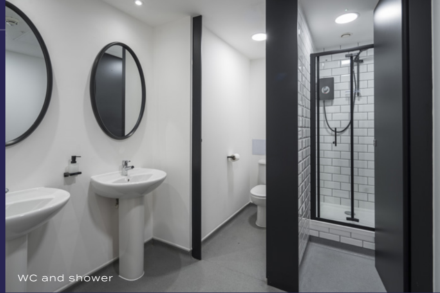
WC and shower