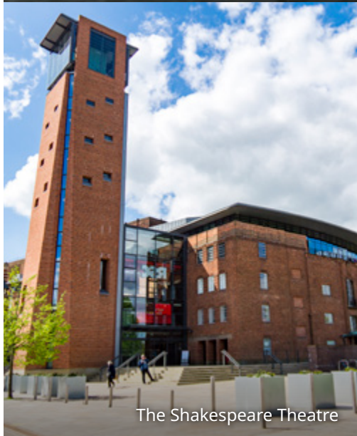
The Shakespeare Theatre