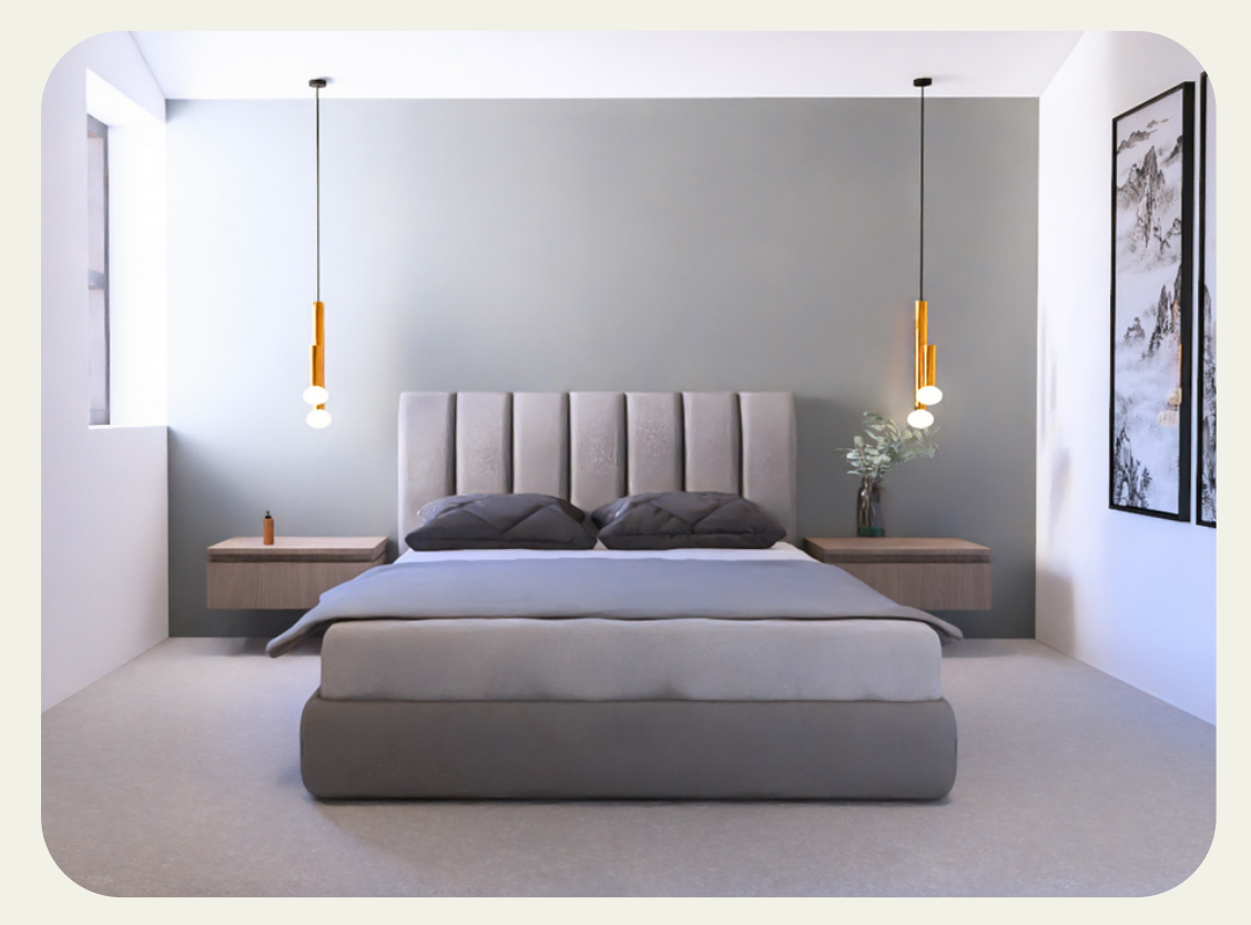
Asking price £340,000 5% discount for off-plan purchase