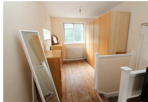
Stairs to first floor hallway