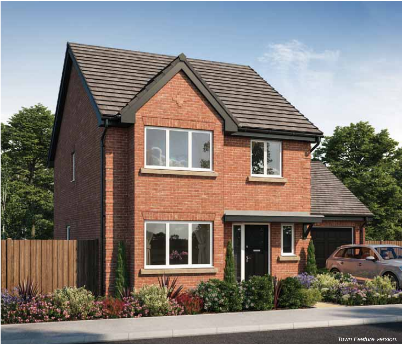
Town Feature version.