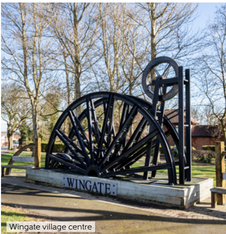
Wingate village centre

It will also appeal to growing families seeking more space and well-regarded schools, with the coastal pleasures and family activities of Seaham just a short drive away. The development is close to several amenities catering to everyday life, including a medical centre, post office and supermarket all within just two miles of home.