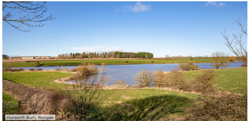
Hurworth Burn, Wingate