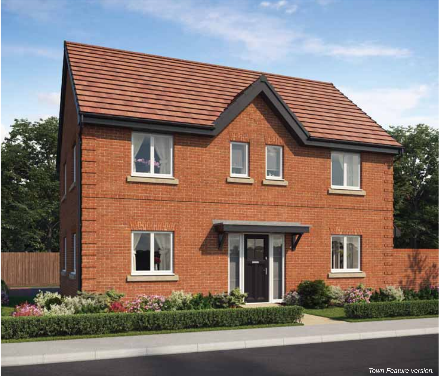
Town Feature version.